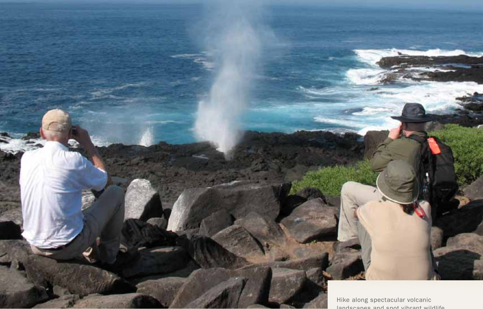
Hike along spectacular volcanic landscapes and spot vibrant wildlife — it's all part of the adventure of Galapagos!