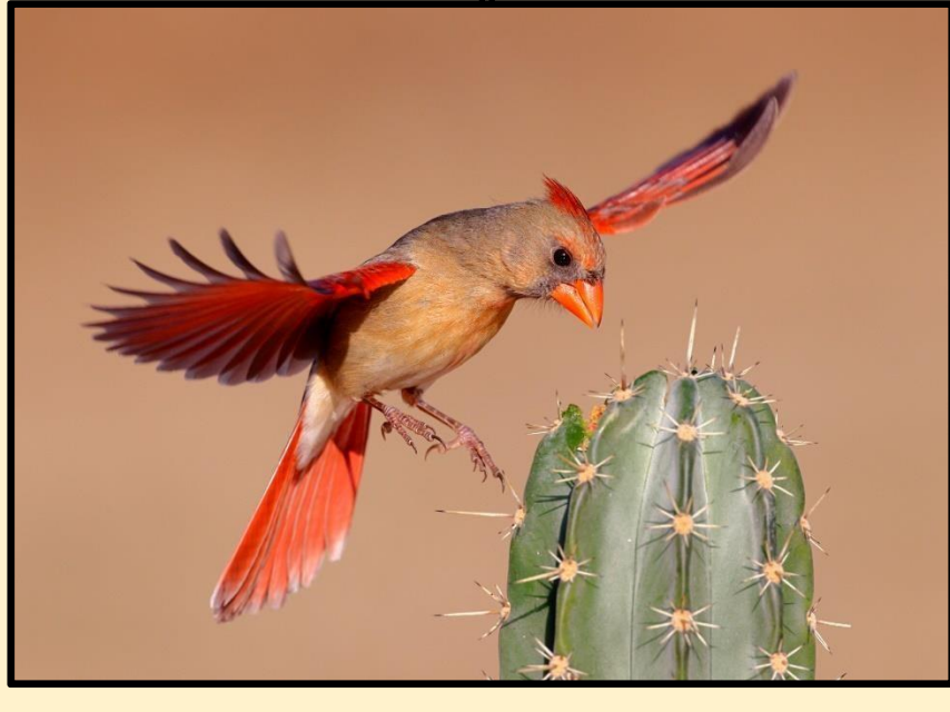
Figure 3 Northern cardinals are common in south Texas and readily attracted to the water and food provided at the ranch.

morning and two evening blinds that we share. On the last day, we all photograph using the raptor blinds at the Martin Refuge.