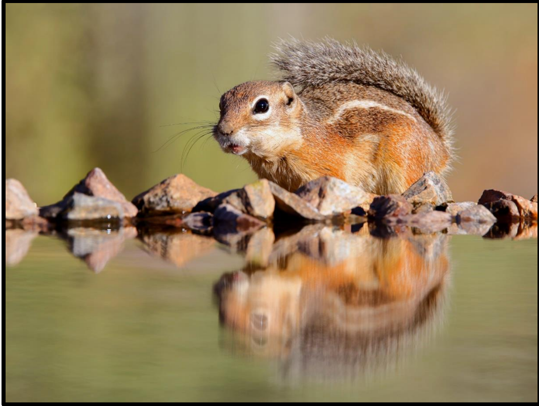
Figure 13 The Harris antelope ground squirrel often comes to the reflection pool in the morning to drink.