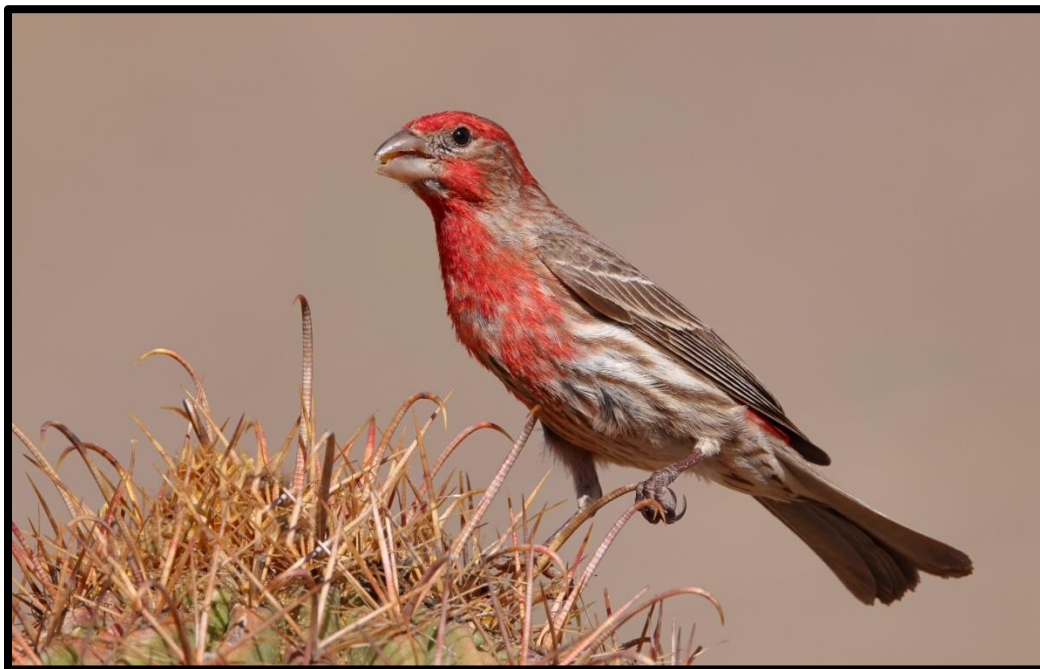
Figure 5 The beautiful house finch will offer you numerous photo opportunities.

We eat breakfast together at the hotel and say good-bye to our little “family” of photographers. We are available all day to take you to the airport.