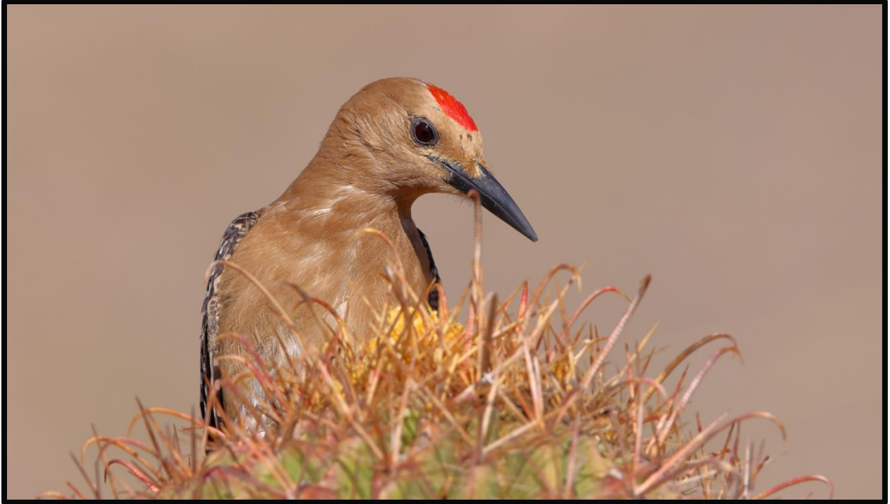
Figure 11 We just love the red patch on the gila woodpecker.