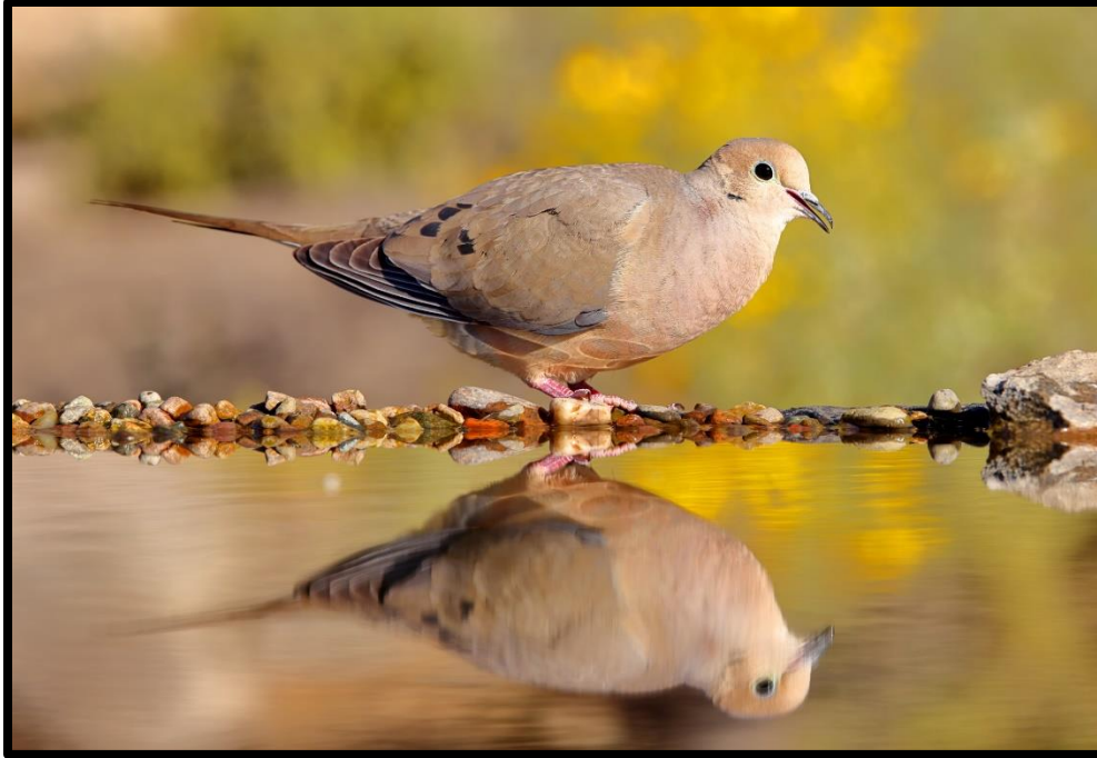
Figure 4 Mourning doves are plentiful at the reflection pool.