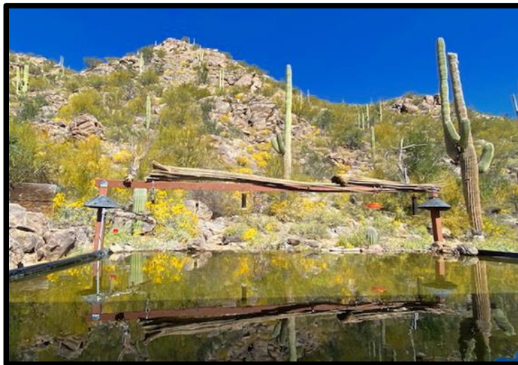
Figure 6 A view of the reflection pool from inside the blind. We put a few seeds and meal worms in the stones at the back edge of this pool to lure birds in, plus many come to get a drink anyway and that produces wonderful reflections. The back edge of this pool is about 10 feet from where you are photographing and concealed in the blind. John's Canon 600mm does not focus that close, but his Canon 100-500mm does and that lens is terrific at the reflection pool!