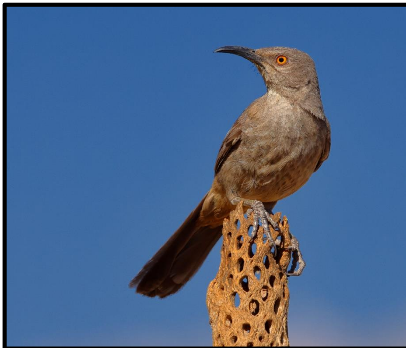
Figure 2 The curved-billed thrasher on a cholla stick.