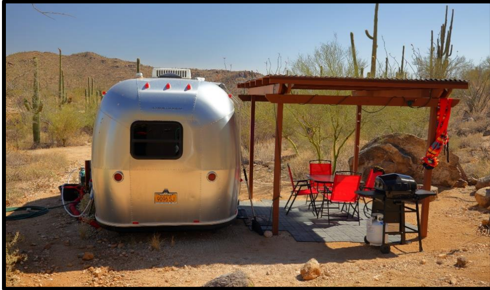
Figure 9 This will be our base camp at the Desert Retreat where we have electric power, water, restroom, and nice chairs to sit in. Notice how remote this camp is compared to Tucson.