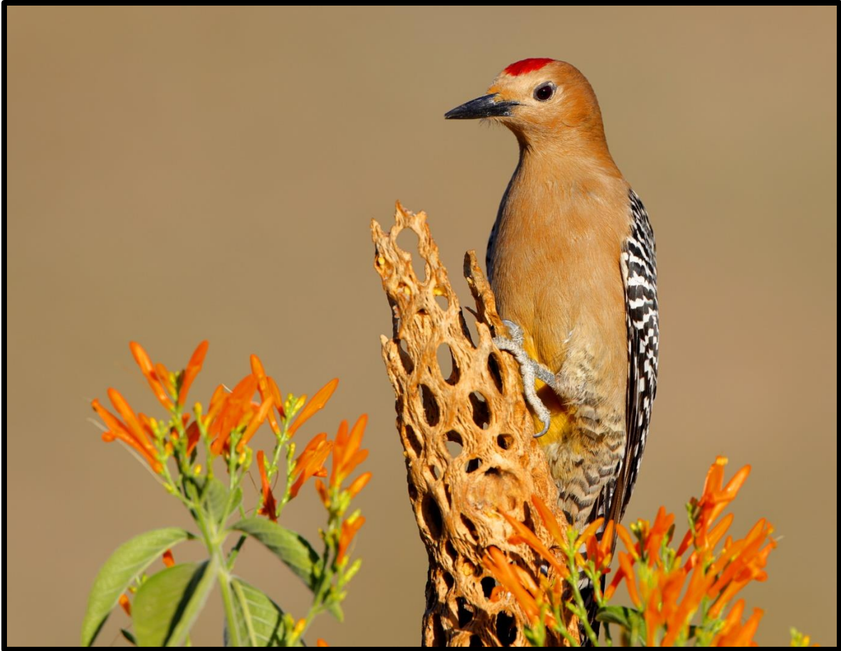
Figure 7 Gila woodpeckers are fun to photograph and frequent visitors at the Desert Retreat setups. They are incredibly abundant at the Desert Retreat. You could call them a “flock of woodpeckers.”