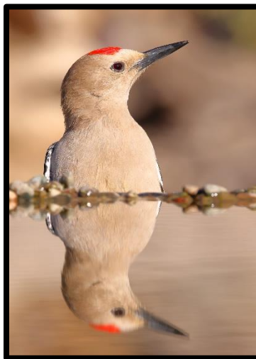
Figure 3 Gila woodpeckers are abundant at the Desert Retreat. Often a dozen are present simultaneously.

We travel together in our Ford Expedition Max SUV. Each morning field trip begins early (6:15 am) as we plan to be at the Photo Retreat, duck pond, or San Xavier Mission at sunrise when bird activity is high, and the light is superb. We will shoot thousands of images, break for a hearty lunch, and return to the desert retreat in the afternoon to shoot thousands of additional photos.