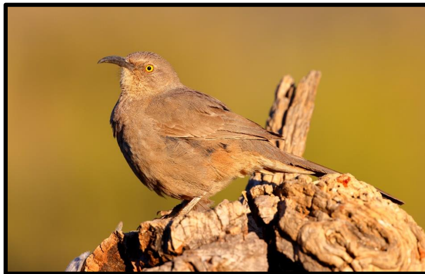
Figure 8 Curved-billed Thrasher