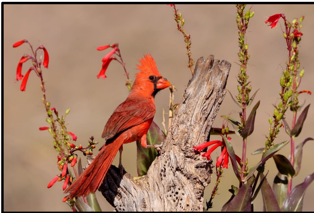
Figure 1 A Northern cardinal searching for food we hid among the flowers..

The Desert Photo Retreat is designed for wildlife photographers. Ron and Janine Niebrugge winter in the beautiful Tortolita Mountains north of Tucson, Arizona.