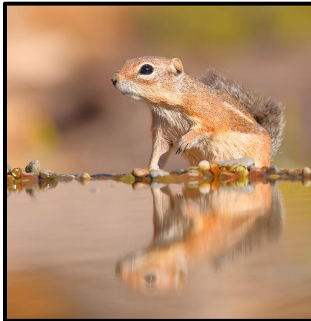
Figure 10 Harris's ground squirrels visit the reflection pool rather often.