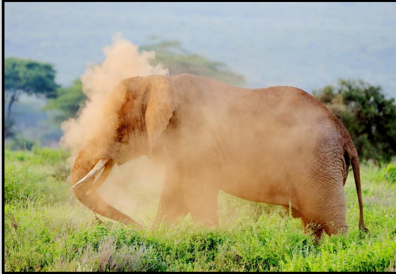
Figure 5 Nothing like a thorough dust bath to start your morning!!!!