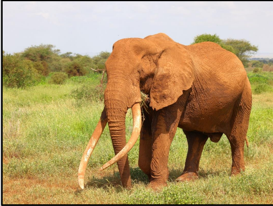
Figure 3 This huge tusker is a famous elephant in Amboseli. His name is Craig.