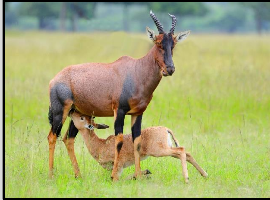
Figure 2 Topi with a hungry calf.