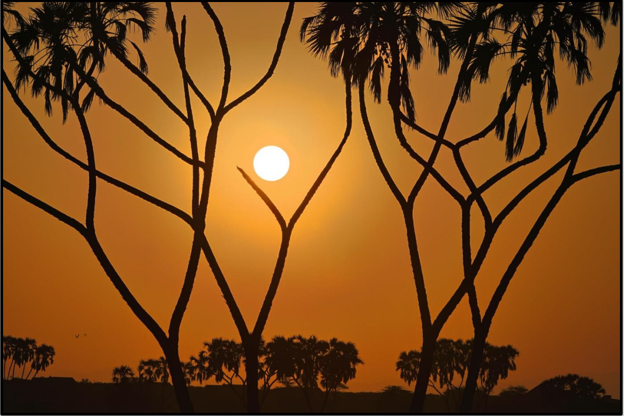
Figure 7 Sunrise with doum palms in Samburu.