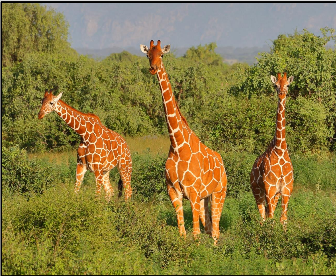
Figure 4 Due to heavy rains in November, the normally dry Samburu was super lush with new green leaves when we arrived to photograph this group of reticulated giraffes.