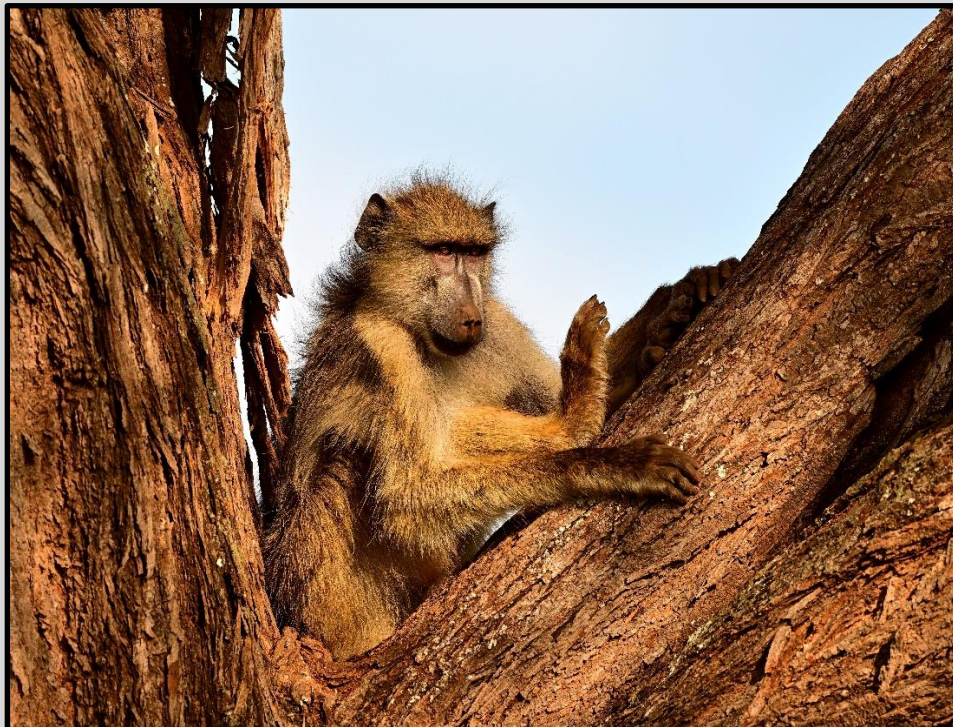
Figure 16 Dixie enjoyed photographing this olive baboon resting in the "perfect spot."