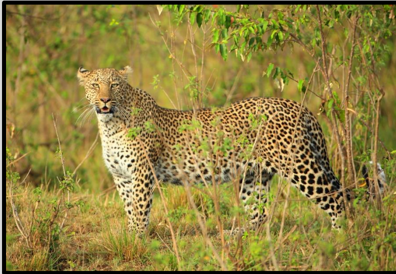
This leopard emerges from the bush to offer a nice pose for a few seconds. Learn to shoot precisely and fast!

John and Dixie are avid photography instructors who have no secrets. We teach you everything. We know you want to become a skilled photographer because that makes photography more fun and rewarding. While we teach the ultimate photo skills you must master to shoot superb images, they are easy to learn. We will advance your photo skills by several notches. This goal is especially easy to achieve because we are with you the entire tour in Kenya to guide you and continually teach you about photographing wildlife. And with an abundance of wildlife to photograph all the time, you get tons of opportunities to practice new photo skills.