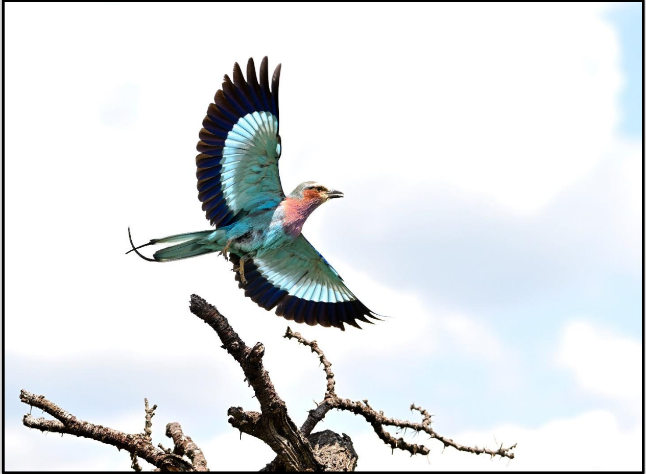
Figure 17 Dixie shoots a lot of birds perched in trees, but her real goal is to get photos of this lilac-breasted roller in flight.