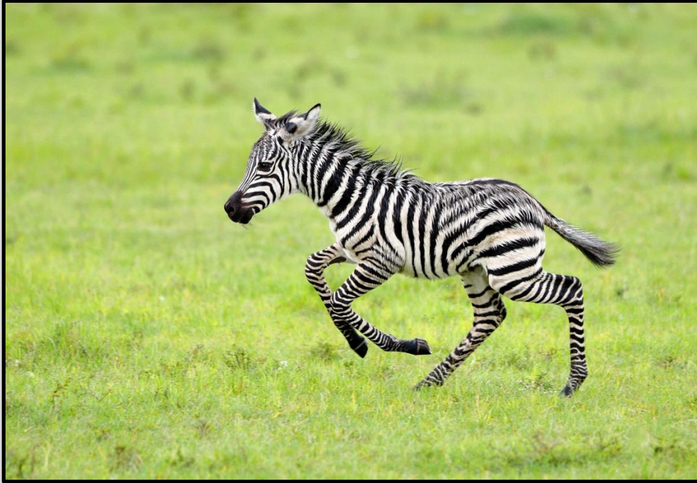
Figure 11 A baby common zebra scampers around the Mara grasslands.