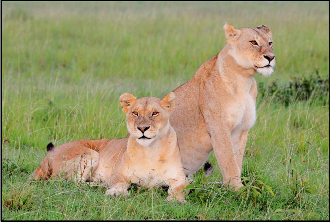
Figure 9 Lions are plentiful in the Masai Mara. We find some to photograph most game drives.