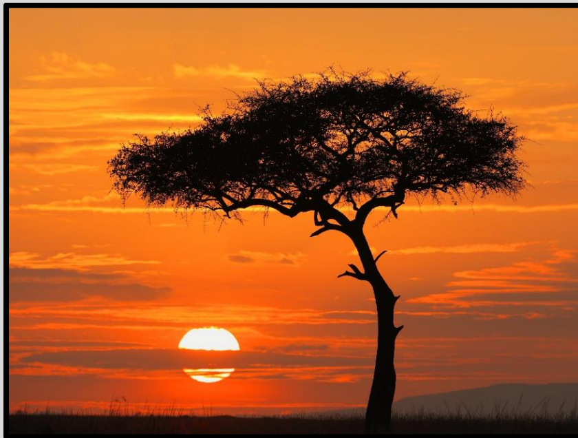
A Masai Mara Sunrise with the iconic Acacia Tree

This perfect photo tour for photographing Kenya's birds and mammals!