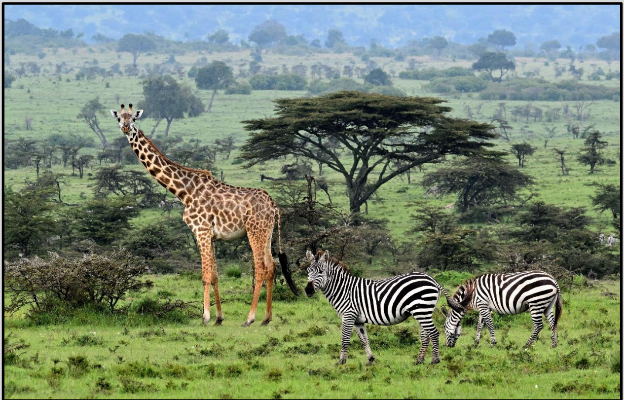
Figure 14 Dixie was wise to include more of the fabulous landscape in Amboseli because this shows the Masai giraffe and common zebras among their acacia tree and grass plains home.