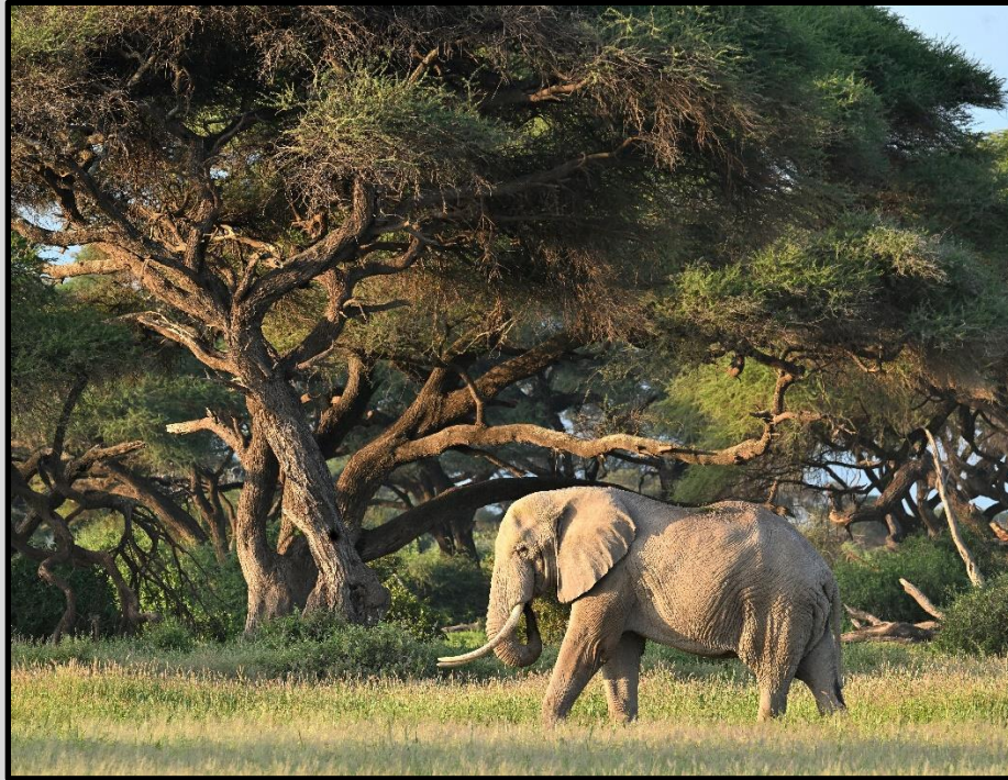
Figure 15 Everyone knows how big elephants are, but even some of the trees in Kenya dwarf elephants. Dixie wisely kept the elephant small (if that is possible) to compare them to the massive forest.