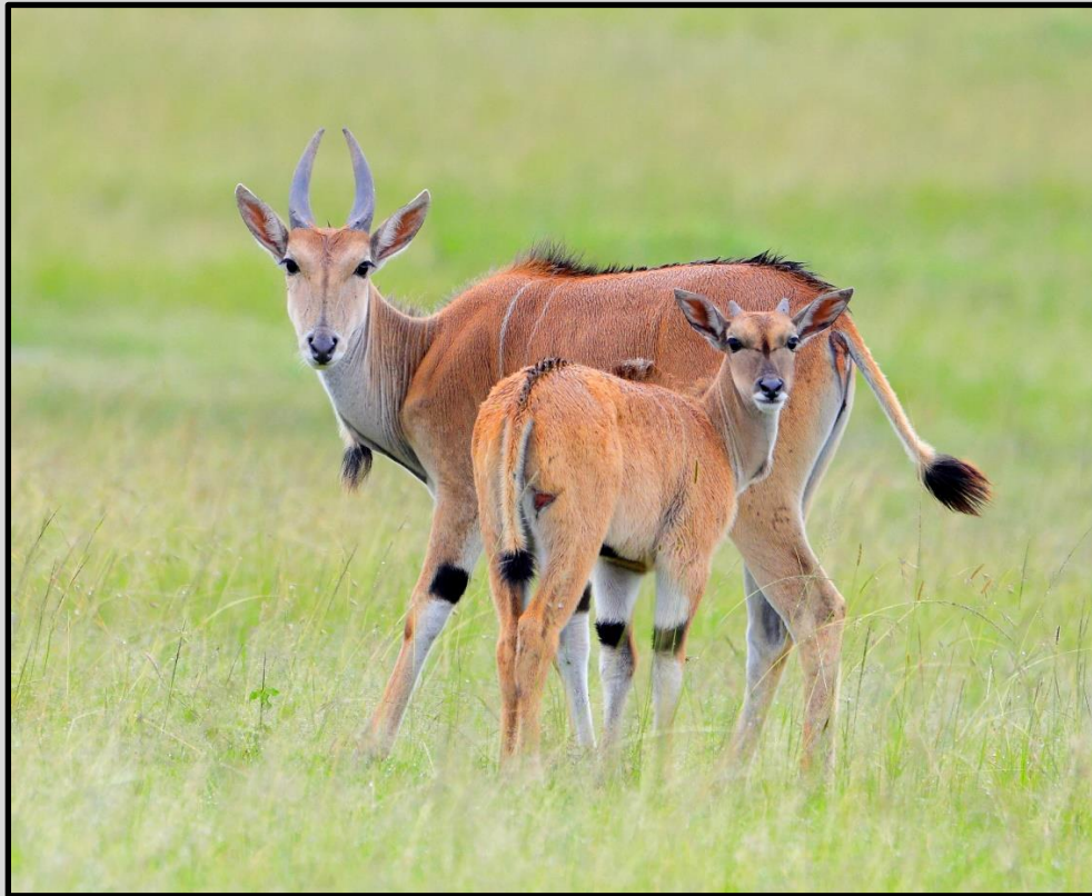
Figure 12 Eland with calf. The short rains in Kenya occur in Nov. and Dec. By early January, things are drying out and most areas are quite green, and the wildlife often have youngsters with them.