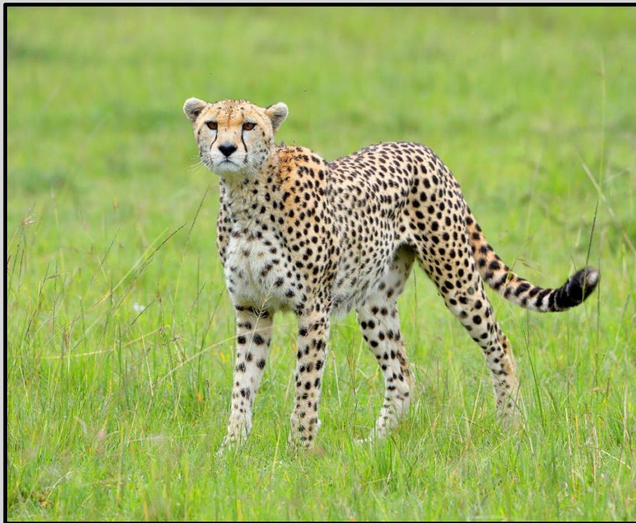
Figure 10 Cheetahs are often photographed in the Mara too.