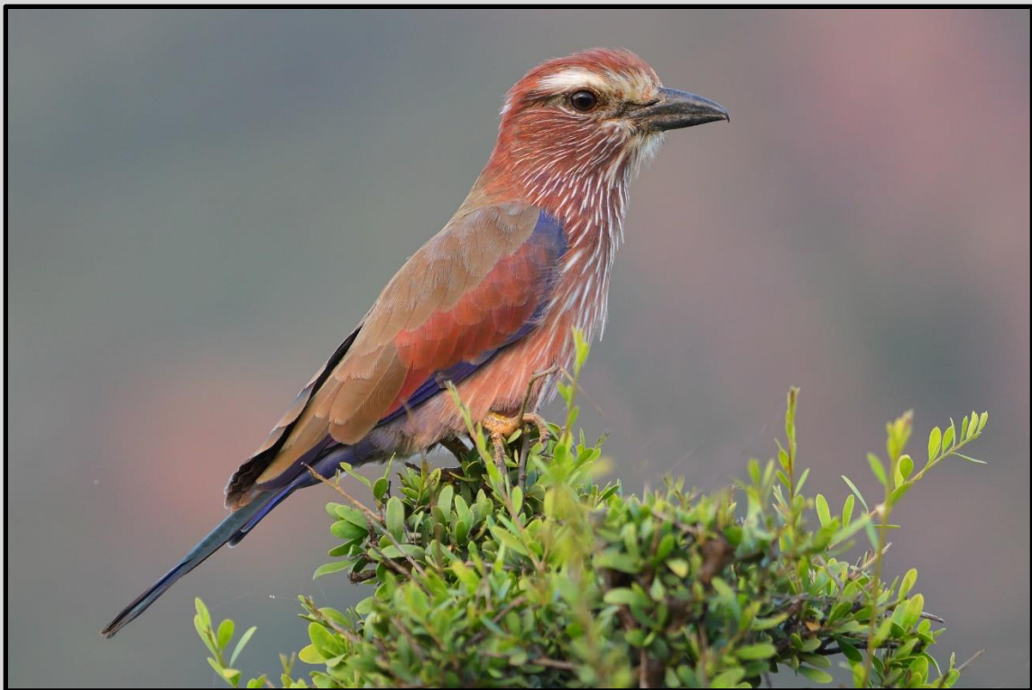
Figure 8 The gorgeous rufous-crested roller.