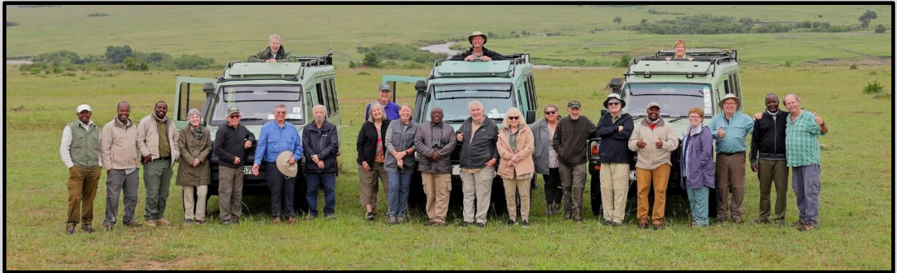
Figure 13 Our group on the 2023-2024 Kenya safari. Note: Three land cruisers are not pictured. We only have three participants per vehicle. The more vehicles, the more you find as each vehicle has a radio to let the others know about a special photo opportunity such as finding a leopard, cheetah, or lions.