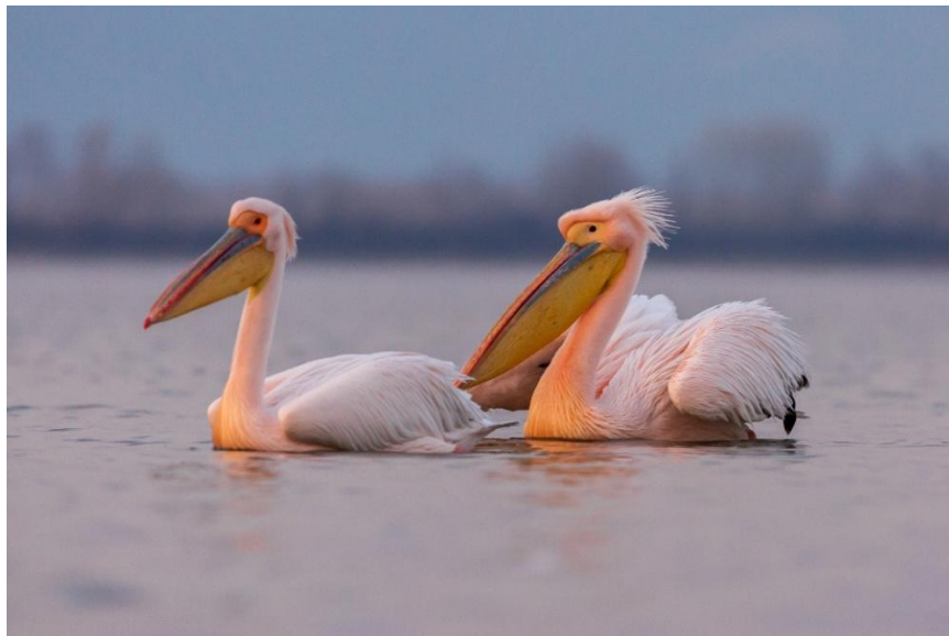
Figure 1 Dalmatian pelicans in peak breeding plumage

I've long admired close-up and action images of the Dalmatian pelicans in Greece. While planning a Kenya tour for January of 2027, I looked into the best time to photograph these approachable birds in peak breeding plumage. Surprisingly, the ideal period is late January into February, with the first week of February being both a terrific time to photograph them and it also coincides with the end of our Kenya tour. So why not make a slight detour on the way back to the states and stop in Greece first?