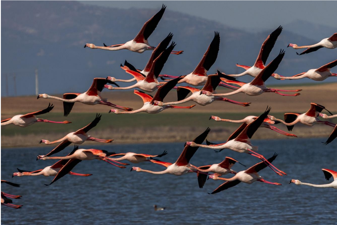
Figure 9 We expect to photograph other species. Here is a flock of flamingos passing by.