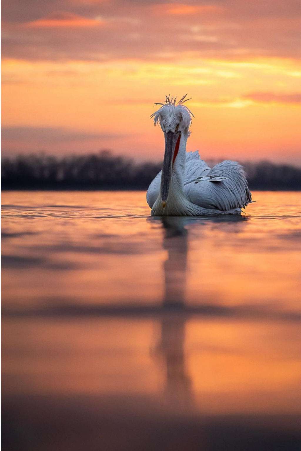
Figure 8 Sunrise and sunset provide gorgeous opportunities.