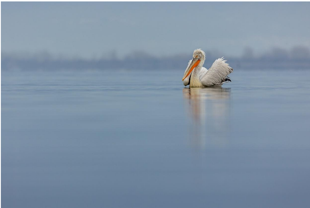
Figure 10 Imagine this pelican swimming toward you in the calm morning water.