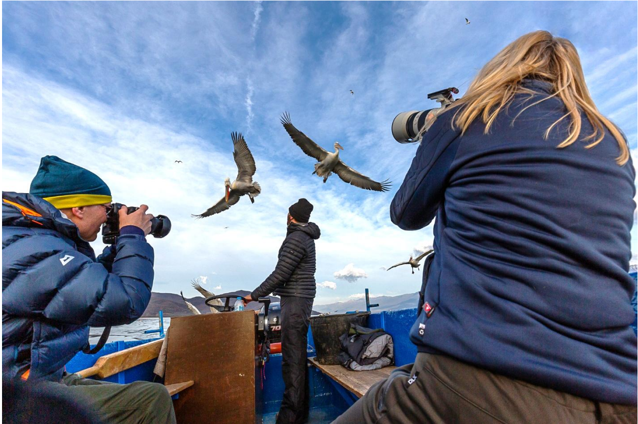
Figure 6 Lots of flight photos await you!