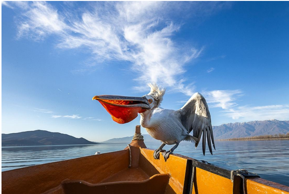
Figure 4 They will land on the boat with you.

During the time of the trip, the birds display their most photogenic breeding plumage. Their normally curly nape feathers become more pronounced, and their pouch turns vibrant orange-red, adding striking color contrast. Calm conditions allow for tight headshots with catchlights in the eyes and perfectly mirrored reflections beneath.