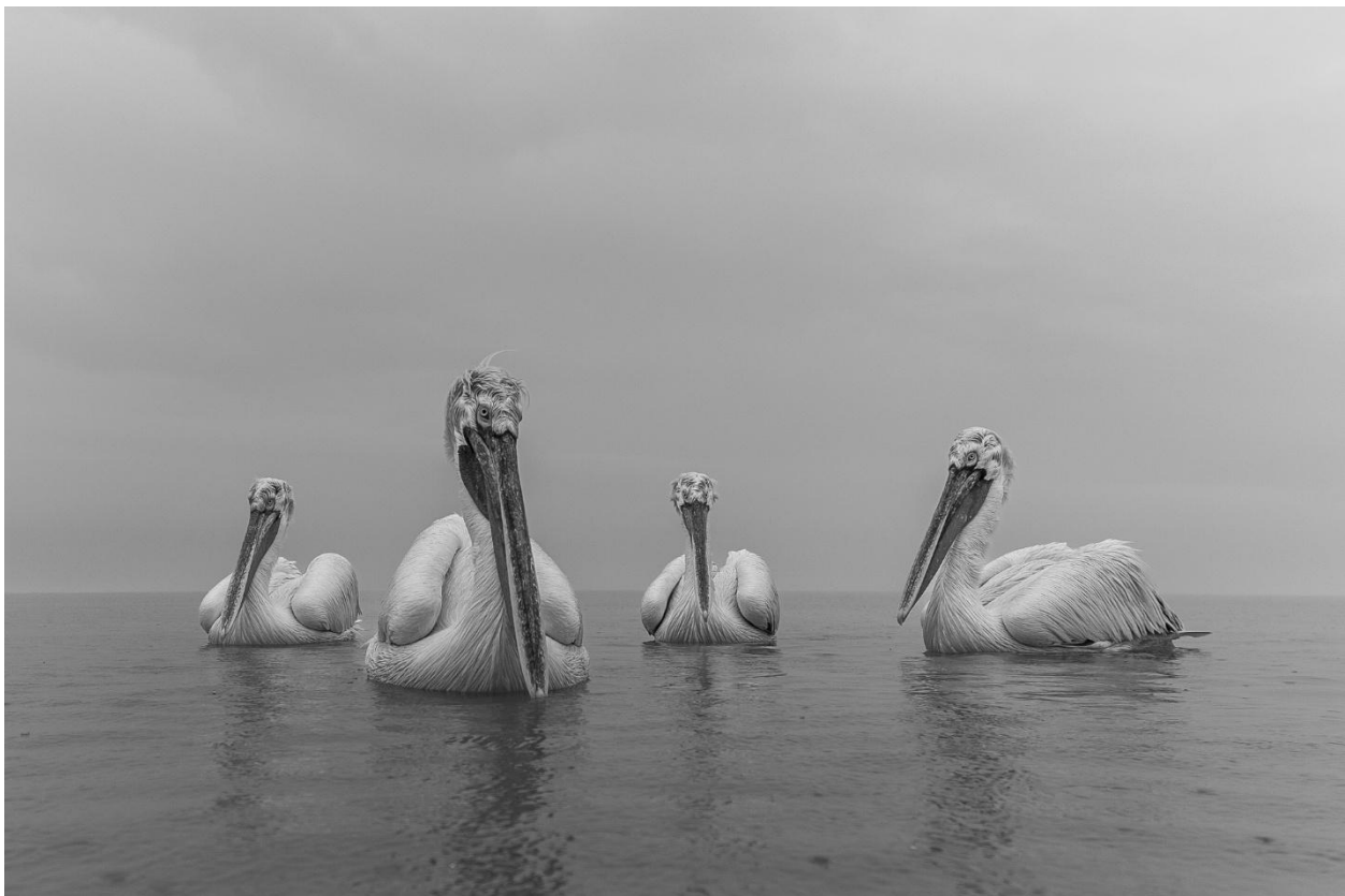
Figure 3 Black and white is another way to show them. Notice the low angle from the small boat.

One of the greatest advantages at Lake Kerkini is the ability to photograph pelicans from small boats that put you close to the water. This provides stunning eye-level angles, allowing you to capture reflections, water textures, and perfectly blurred backgrounds. The proximity of the birds makes it possible to fill the frame with detailed head portraits-