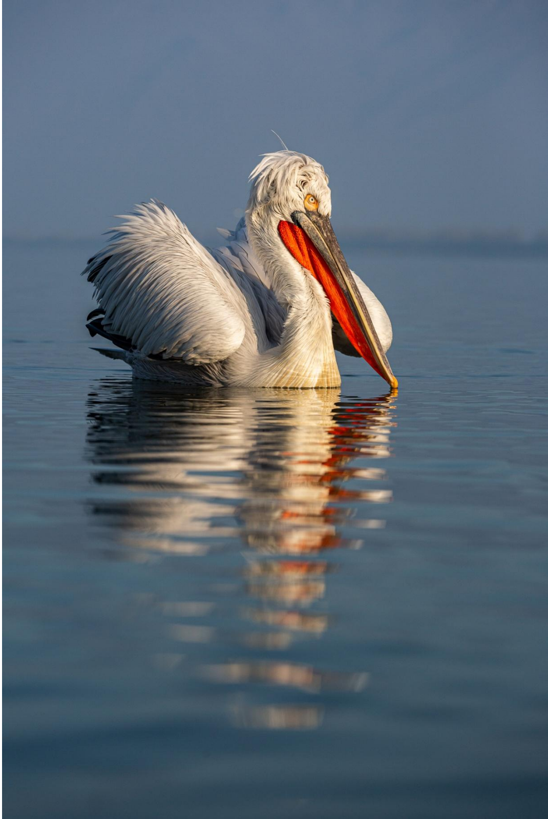
Figure 5 What a beautiful pelican!!!!