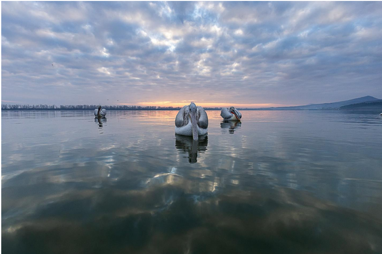
Figure 7 Wide-angles lenses are useful!