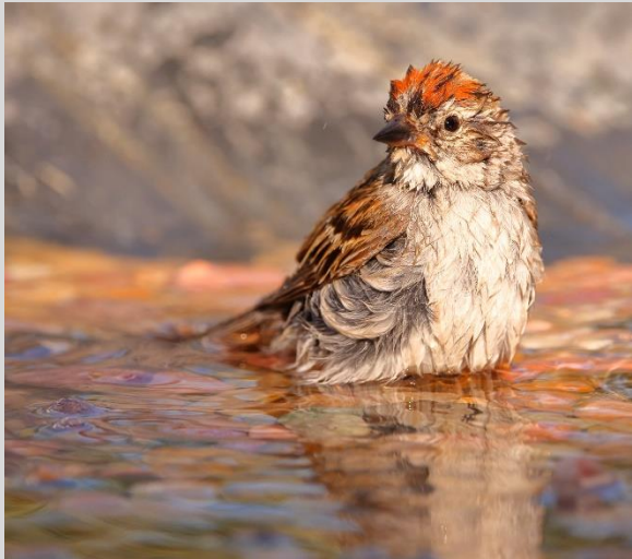
Figure 16 A yellow-pine chipmunk, MacGillivray's warbler, chipping sparrow, American robin, a reflection pool, and a pine siskin .