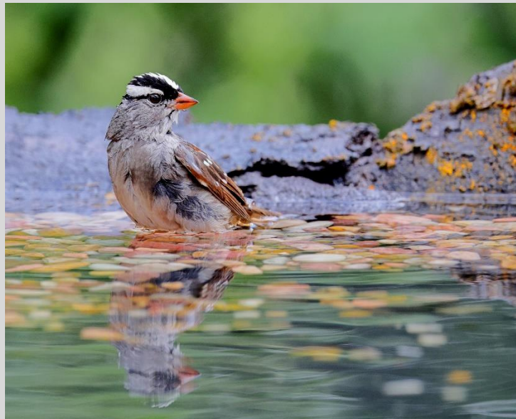
Figure 15 An adult white-crowned sparrow at the reflection pool

We added the red leaves to show autumn is coming and this male evening grosbeak decided to rearrange them. The Canon 100-500mm lens works perfectly for photographing wildlife at reflection pools as the subjects are only 8-12 feet away.