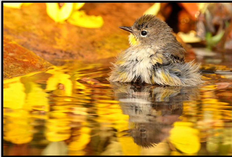
Figure 14 Expect to get plenty of chances to photographing bathing birds like this Audubon's warbler, one of our more common visitors in late August.

Please let Dixie know your flight arrival and departure times prior to your arrival on the first day of the workshop. Call us when you land so we can pick you up. It is possible to fly into Bozeman the night before and we can pick you up at your chosen hotel. Please book your flight to arrive before 4pm and your return flight home after the workshop should be no earlier than noon. We plan to get everyone to the airport by 10am on the last day.