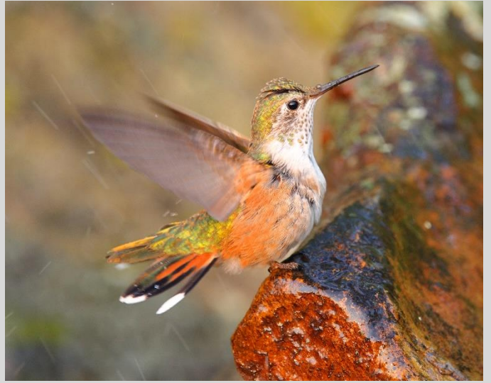
Figure 17 Broad-tailed Hummingbird