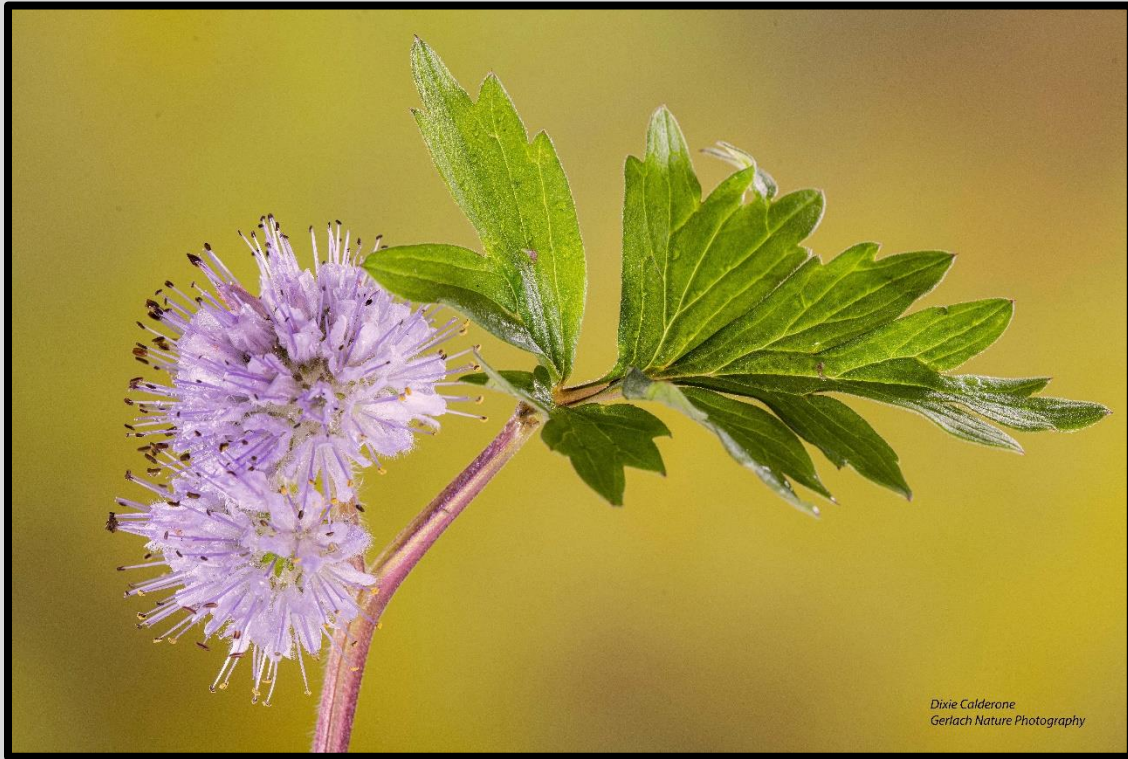
Figure 4 This wildflower is a weed that grows in our garden, but it makes a fine close-up subject. We are using a photo background and 3 LED lamps to light it.

John and Dixie are avid photography instructors who readily share all their knowledge. While we teach the ultimate photo skills you must master to shoot superb images, they are not hard, and everyone can learn them. We will advance your photo skills considerably. This goal is especially easy to achieve because the group size is only 3 participants with two full-time instructors, allowing us to provide unlimited one on one instruction!!!!