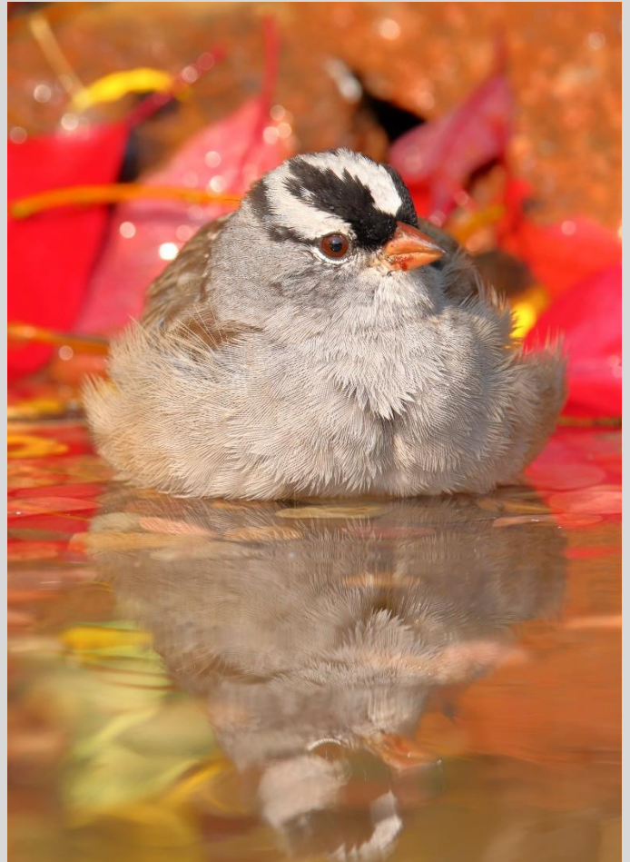
Figure 21 White-crowned sparrow