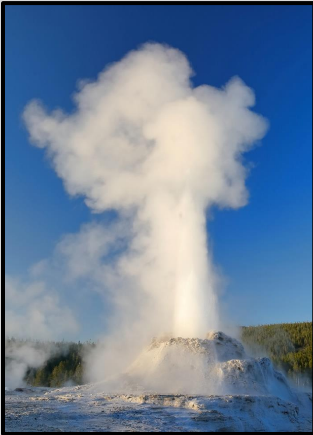
Figure 9 Castle geyser erupts twice a day. It is not easy to photograph due to the long 12-hour eruption intervals, but when it does, you get 45 minutes to photograph the action.