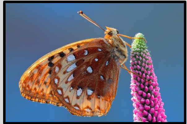
Figure 6 Using LED lamps indoors is a successful way to photograph butterflies while creating pleasing light such as the backlight used on this great-spangled fritillary.