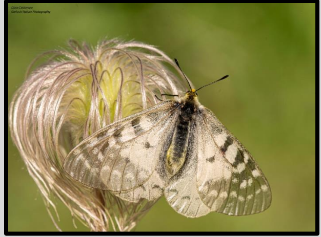
Figure 8 Rocky Mountain Parnassian butterfly