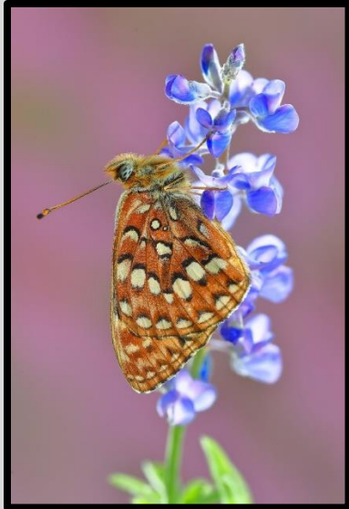
Figure 5 Fritillary butterflies are likely subjects in our close-up photo sessions.