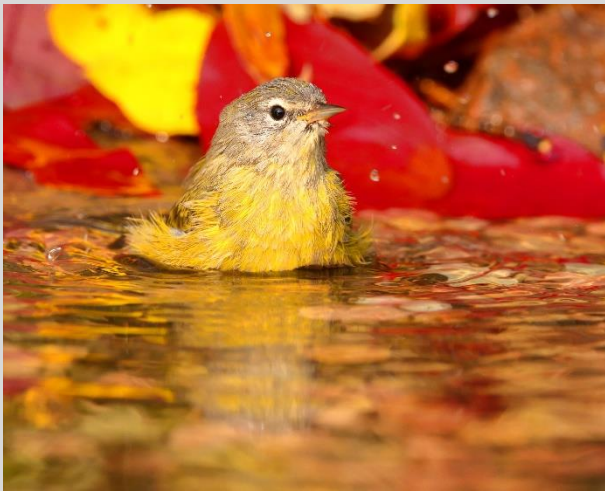
Figure 19 Orange-crowned warbler