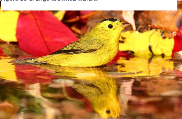
Figure 20 Wilson's warbler