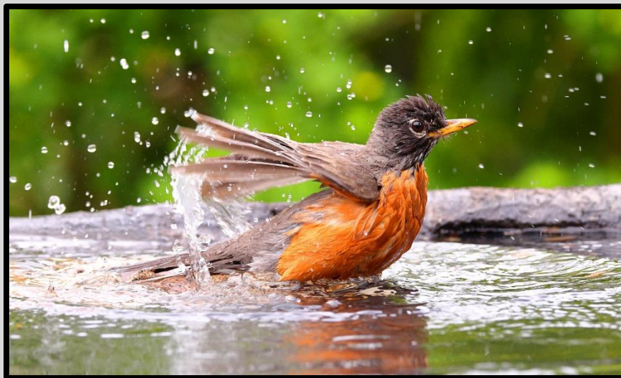
Figure 1 American robins relish a dip in the reflection pool. This is a pool of water six feet long by 3.5 feet wide and 2 inches deep. It is made by using sawhorses, heavy boards, a wooden pool frame, and a pond liner to hold the water. The pond liner is hidden with natural objects. We teach you how to easily and inexpensively do this.

We love being at our mountain home and know many of you would thoroughly enjoy it too. Our home is adjacent to the lodgepole pine forest on a mountain slope at 6600 feet. Our ten acres border the national forest that begins right behind our garage and that makes it a super place for wildlife photography. Our property is alive with birds who are attracted to our sunflower seed feeders and reflection pools with water drips.