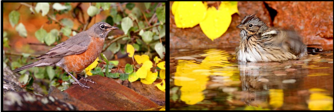
Figure 12 The American robin (left) and the Lincoln's sparrow both are attracted to our reflection pool setups.

Lunch will be at our home or at a restaurant should we be traveling then. We will enjoy dinner at the best available restaurant when we are traveling. Should we be home at sunset, then we will enjoy dinner at our home.