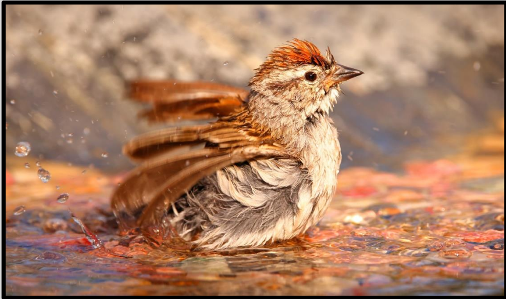
Figure 11 A chipping sparrow takes its bath in our yard drip. While this species is not interested in birdseed, it sure loves coming to water.

The world's first National Park, numerous thermals areas, waterfalls, and wildlife are protected within the parks borders. John has lived next to Yellowstone since 1987 and has led more than 150 week-long photo tours inside the park over the decades. You are traveling with John and Dixie, who are park experts. We will monitor weather conditions and take you to super places that are perfect for the prevailing weather conditions.