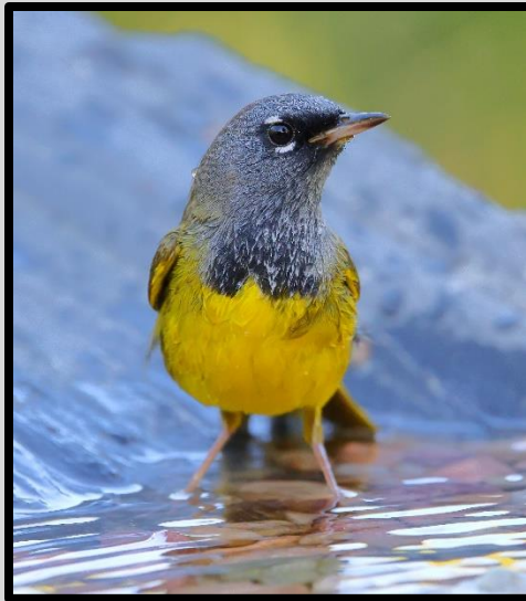
Figure 3 McGillivray's warbler hides in dense brush along creeks, but it readily visits water pools!