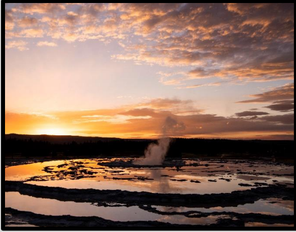
Figure 7 Sunset at Great Fountain Geyser