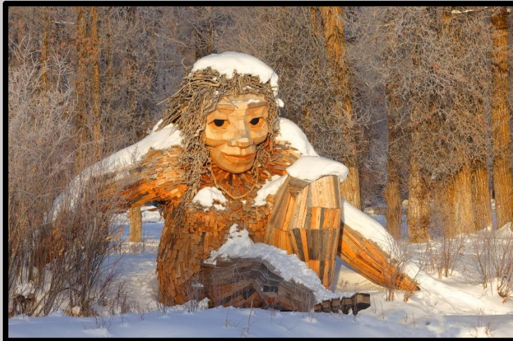
Figure 20 Even this woodland "wild women" is found near Jackson. You will see and photograph it!