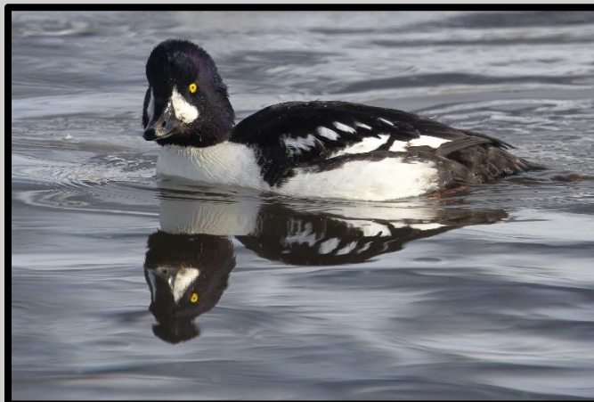
Figure 21 A Barrow's goldeneye swimming on Flat Creek near our hotel.