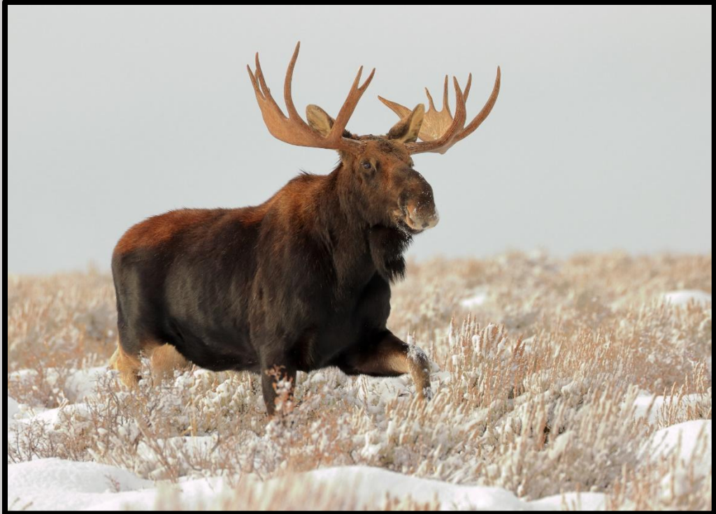
Figure 5 Sagebrush fields are the typical habitat where you find bull moose in early December near Jackson. They eat bitterbrush that grow among the sagebrush.