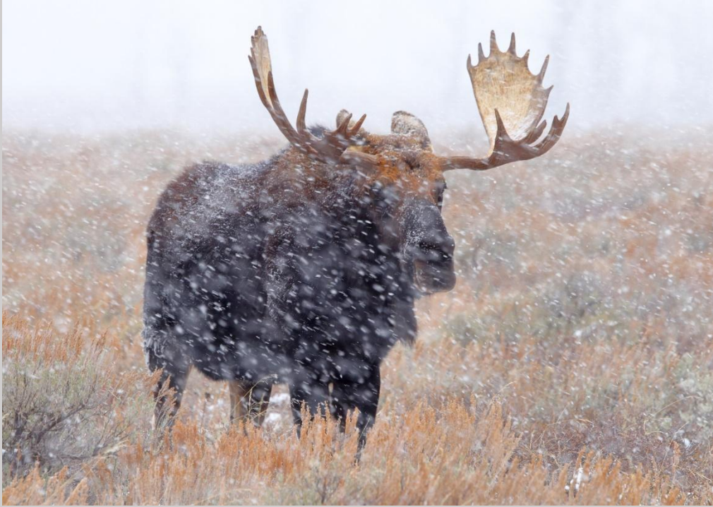
Figure 24 Focus stacking was used to get a sharply focused image of this bull moose in the heavily falling snow.