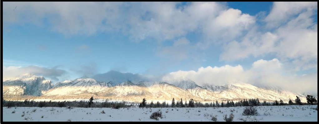
Figure 7 The Grand Tetons Mountain Range