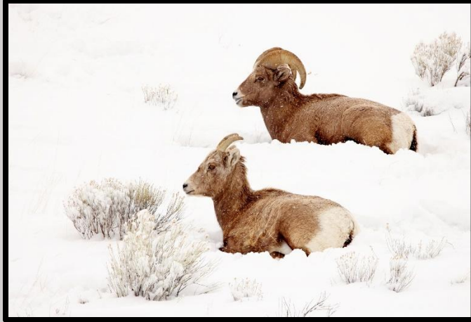
Figure 19 Focus stacking let us sharply focus these two bighorn sheep.