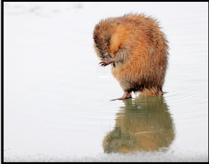
Figure 6 Even a muskrat living at Flat Creek is a joy to photograph.