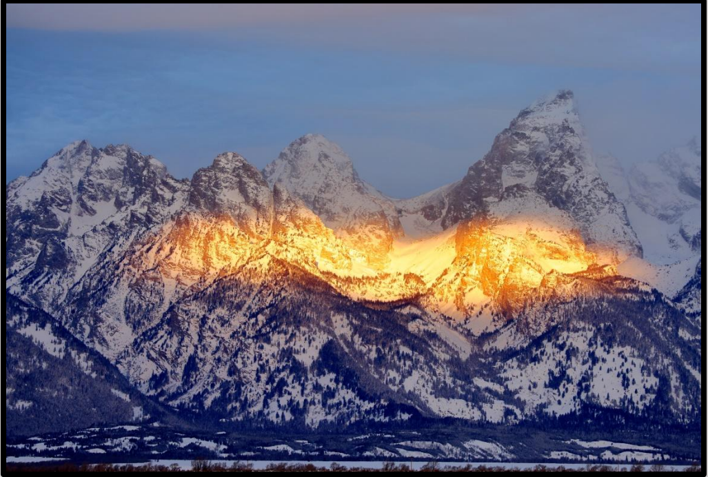
Figure 17 A shaft of dawn sunshine breaks through the clouds to light the Tetons!