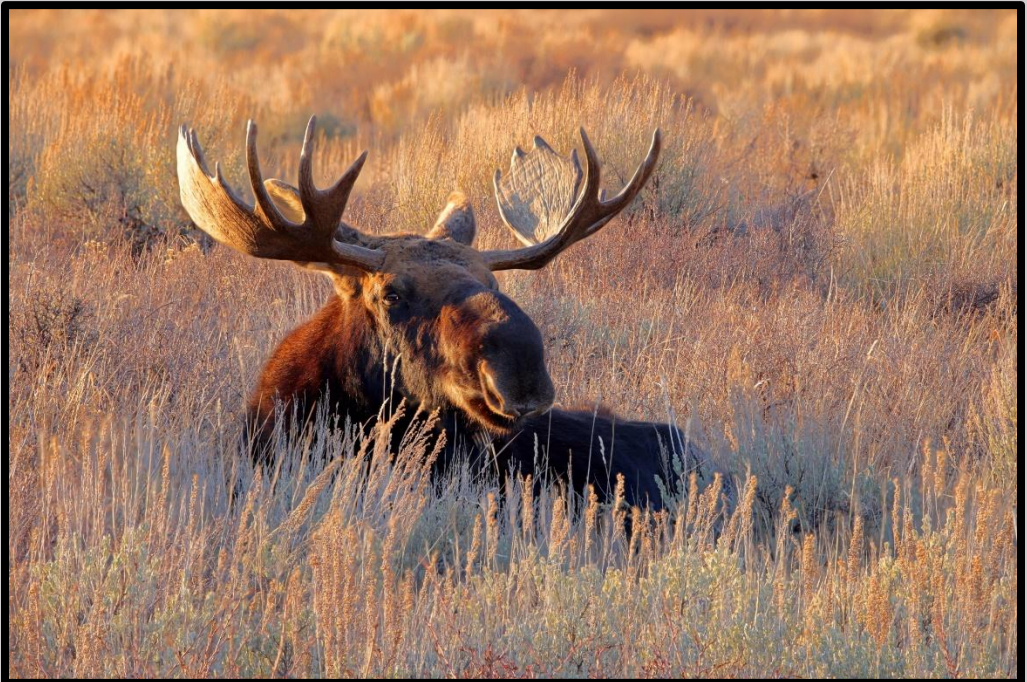
Figure 16 Focus stacking is a super technique for landscapes and macro, but it also works for still wildlife like this resting moose.