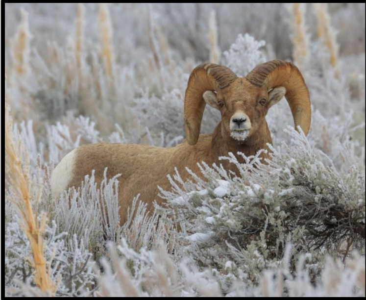
Figure 8 The bighorn sheep are especially photogenic on frosty mornings.