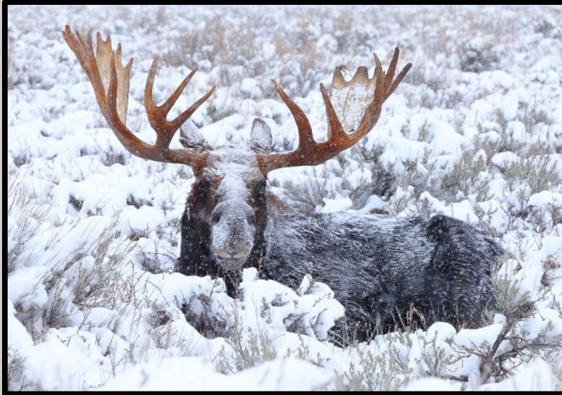
Figure 10 Moose usually take a nap by mid-morning. This is Fremont, a well-known moose in the valley who may have the largest antlers. Manual focus captured a sharp image.