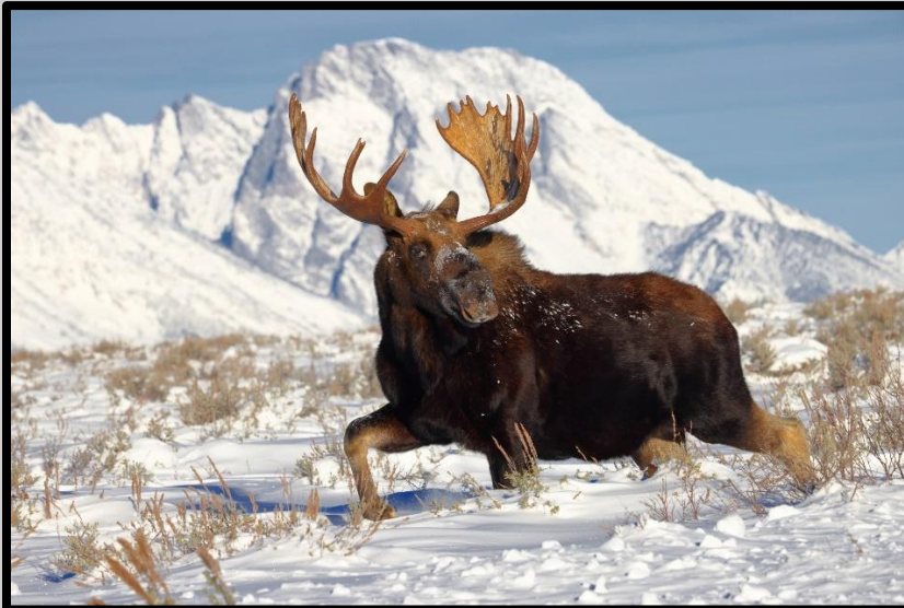
Figure 9 Bull Moose with the Tetons Behind It