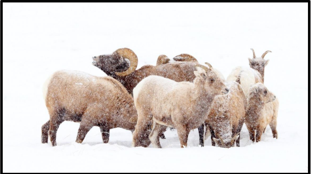
Figure 18 Focus stacking made it easy to get sharp focus of the herd of bighorn sheep amid all this falling snow!