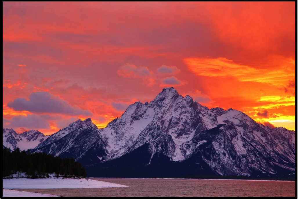
Figure 15 Sunset can be spectacular at Jackson Lake.