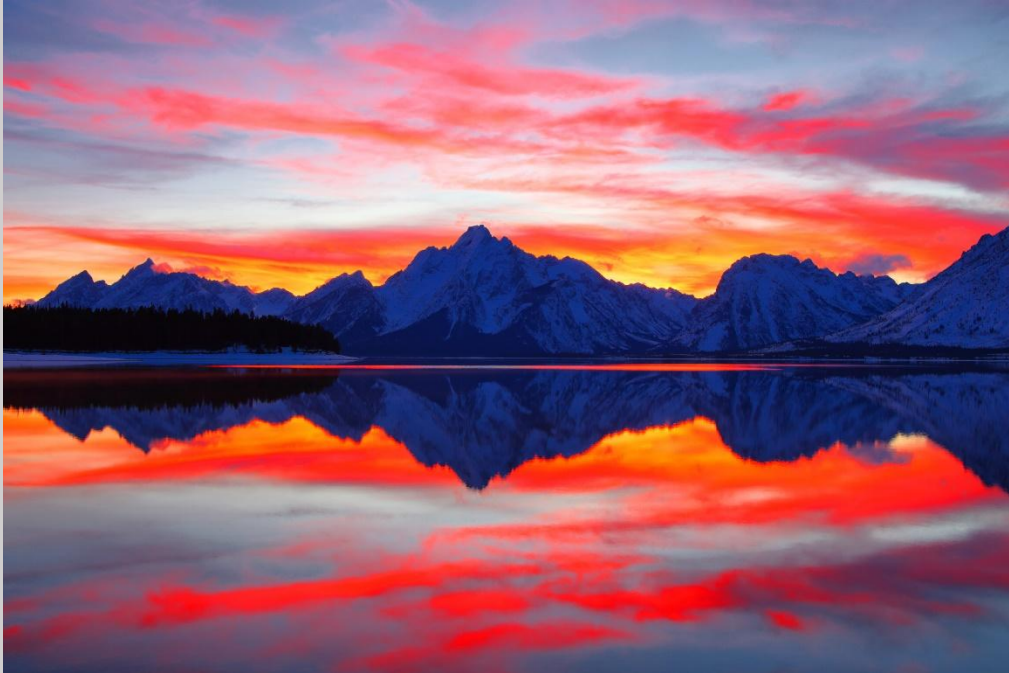
Figure 22 Jackson Lake can get incredible colors from the red light coloring the clouds at sunset during winter.