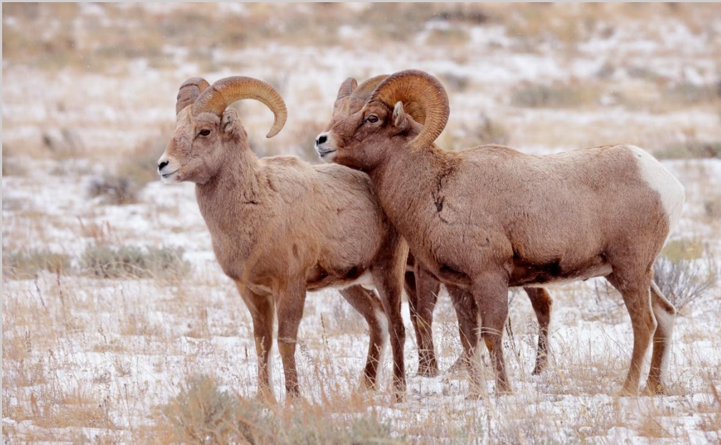
Figure 23 Two Bighorn sheep at the National Elk Refuge that is adjacent to Jackson.