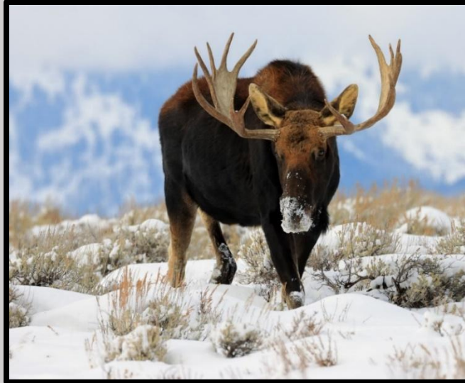
Figure 2 At no other time of the year are bull moose easier to find and photograph. During December they munch on bitterbrush in the open sagebrush fields where they are easy to spot!

Grand Teton National Park offers spectacular landscapes with magnificent mountains towering above the rolling hills and rivers of western Wyoming. Shoot numerous exquisite landscape photos under the expert guidance of John and Dixie as they teach you the best photo techniques to use for producing outstanding images. In addition to the landscape, the bountiful wildlife is an important part of this workshop experience. Plenty of moose are available to photograph and they are quite easy to find and allow close approach of 35 yards. We may photograph elk and bison, and perhaps river otters along Flat creek. Many duck species and trumpeter swans swim in the open creek waters and we photograph those too. And in the National Elk Refuge, bighorn sheep are abundant and frequently feed near the road where they are usually within close photo range. You will get plenty of super close photo opportunities.