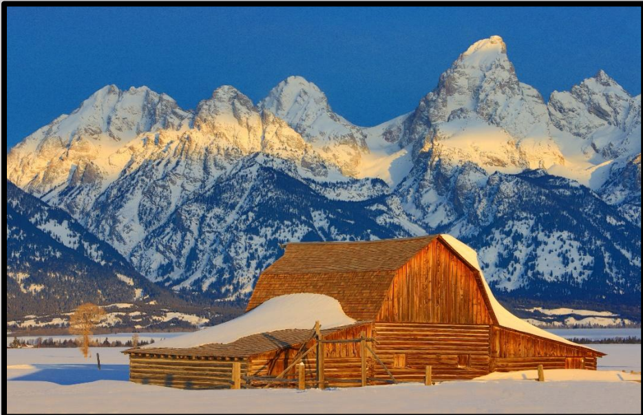
Figure 1 The Mormon barns are wonderful for photos on sunny mornings.

Gerlach Nature Photography is an Authorized Permittee of the National Park Service