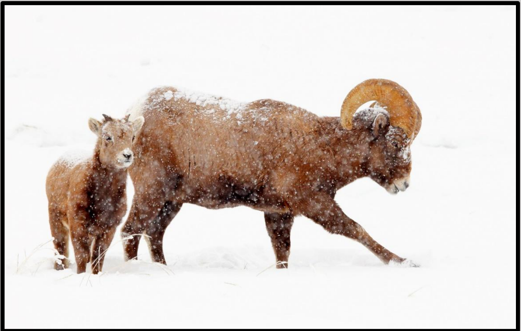
Figure 13 Bighorns at the Jackson Refuge. Getting sharp photos when the snow is falling is an important skill to learn that we are experts at and will readily teach you how.