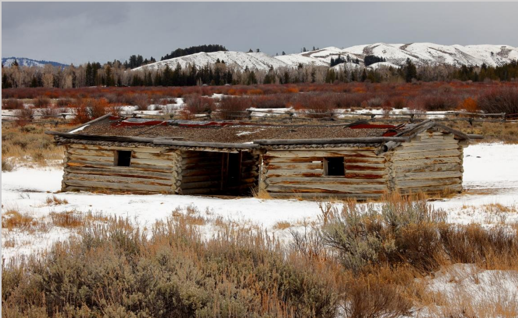
Figure 25 The lonely Cunningham cabin on a cool winter day.