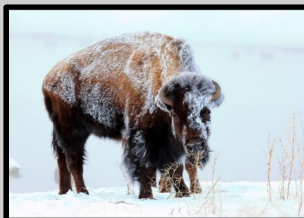
Figure 3 Bison are nice and frosty on cold mornings.

Grand Teton National Park offers spectacular landscapes with magnificent mountains towering above the rolling hills and rivers of western Wyoming. Shoot numerous exquisite landscape photos under the expert guidance of John and Dixie as they teach you the best photo techniques to use for producing outstanding images. In addition to the landscape, the bountiful wildlife is an important part of this workshop experience. Plenty of moose are available to photograph and they are quite easy to find and allow close approach of 35 yards. We may photograph elk and bison, and perhaps river otters along Flat creek. Many duck species and trumpeter swans swim in the open creek waters and we photograph those too. And in the National Elk Refuge, bighorn sheep are abundant and frequently feed near the road where they are usually within close photo range. You will get plenty of super close photo opportunities.