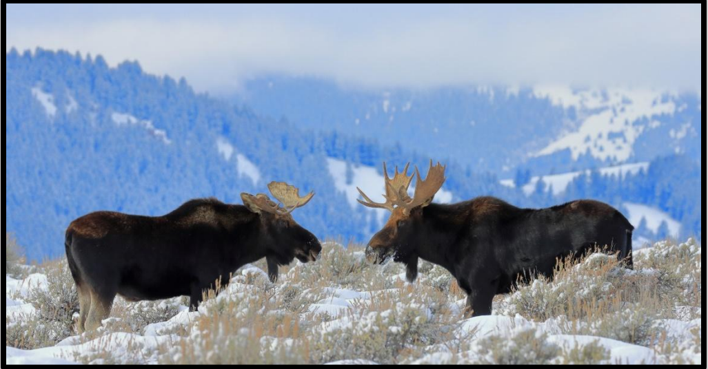
Figure 12 These moose are spending time together in a bachelor herd of six bulls.