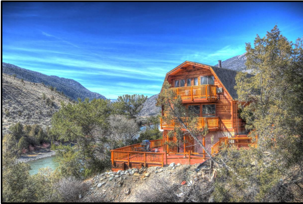
Figure 9 The River House where we are all staying.