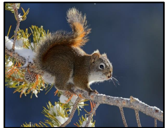
Figure 33 Red Squirrel