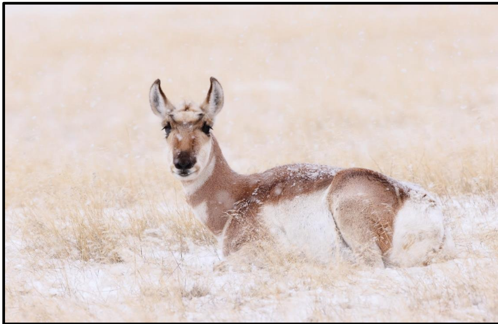
Figure 2 The approachable pronghorn are plentiful near Gardiner.

John has lived near the west gate of Yellowstone since 1990. During that time, between John and Dixie, they have over 800 days of experience leading winter photo tours in Yellowstone. Their experience and enthusiasm for leading photo tours while teaching innovative photography techniques during winter in Yellowstone makes them super photo leaders. Please join us for five days of intensive Yellowstone photography. The interior of the park is terrific for landscapes. However, deep snow causes most wildlife to migrate north to the lower elevations around Mammoth and the small town of Gardiner where there is less snow and warmer temperatures. The abundance and variety of wildlife along the northern range is amazing. For three full days we drive our Ford Expedition photographing herds of elk, bison, mule deer, pronghorn, and bighorn sheep at close distances. Plus, we will find some smaller species like coyote, red fox, river otter, long-tailed weasel, pine marten, and wolf. Come join like-minded nature photographers and be inspired by the incredible scenes and wildlife found here. Dixie and John have spent many thrilling days in Gardiner photographing the herds of wildlife. Where our Yellowstone photo tours were 80% landscapes and 20% wildlife when based in West Yellowstone, now they are 70% wildlife and 30% landscapes when based in Gardiner. You will love seeing and photographing all the wildlife! This is a wildlife intensive photo tour along with magnificent landscapes!