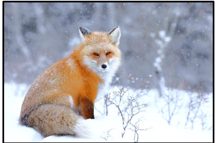
Figure 21 Sometimes luck is with us, and we find a red fox who poses!