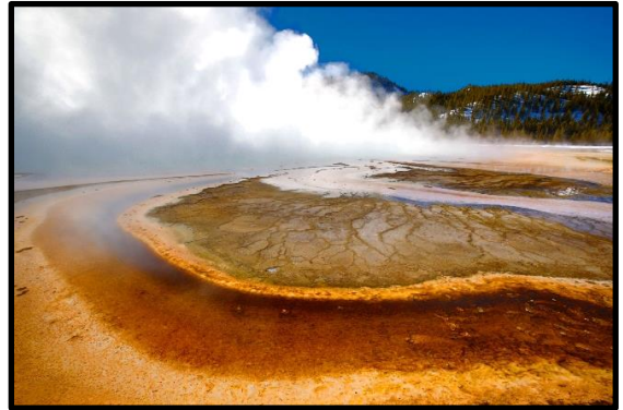
Figure 19 Grand Prismatic Spring