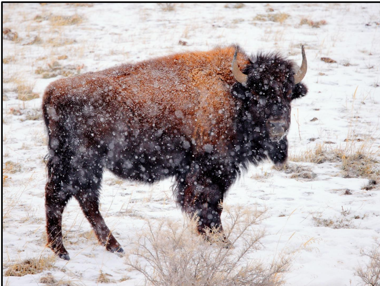
Figure 8 Bison are plentiful on Yellowstone's northern range. Vast herds are enjoying the grass they easily find in the snow.

Fly to the Bozeman Yellowstone International Airport (BZN) and contact the hotel to send a shuttle to take you to the hotel. The next morning, we pick you up in our SUV and take you to our rental home near Gardiner, MT. We have plenty of room for your luggage as we are towing an 8-foot cargo trailer. On the last day, we return you to the airport by 9 am. If you cannot fly out on the last day, then book a hotel, and we will drop you off at the hotel and you can fly out the next day.