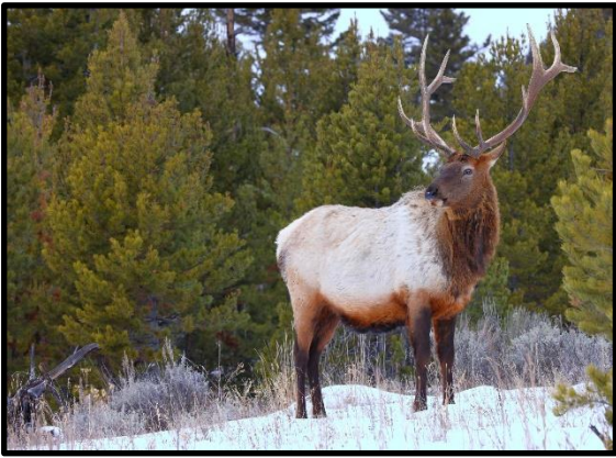
Figure 30 Bull elk