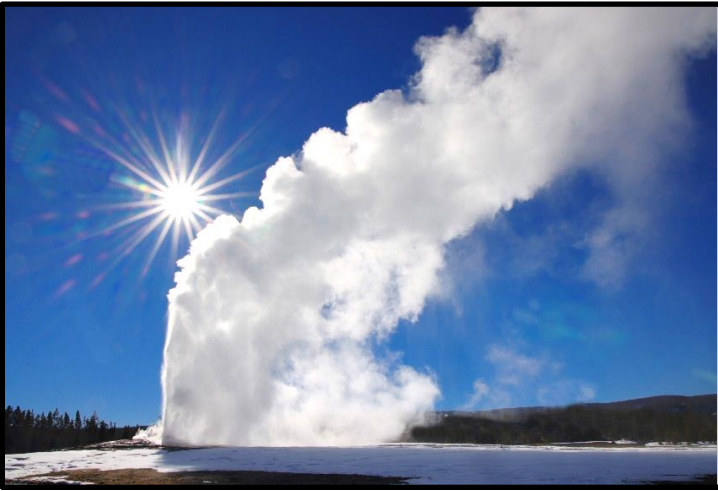
Figure 15 Old Faithful Sunstar