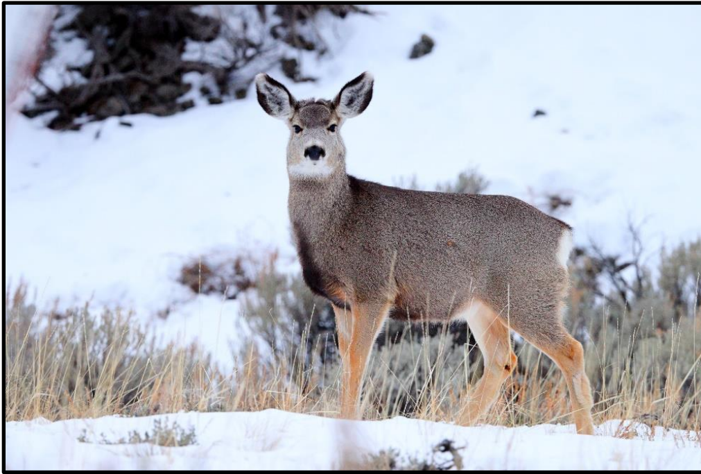
Figure 11 We enjoy all the mule deer found here too. Many of them live in downtown Gardiner.