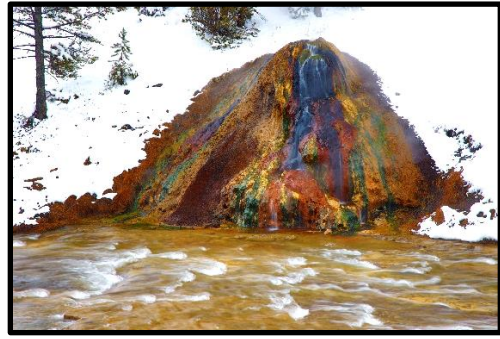
Figure 17 Chocolate Pot