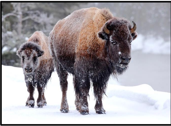
Figure 24 Frosty bison with calf.