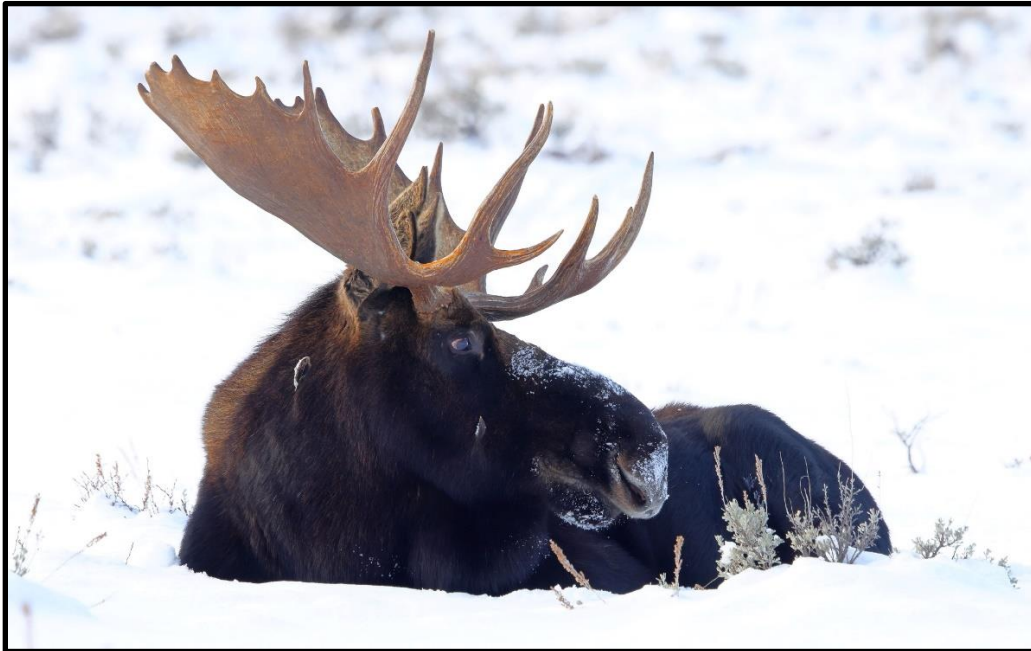
Figure 12 Moose are most sometimes seen along the road to Silver City during a Yellowstone winter. We are going to Silver City, so maybe we will get lucky.