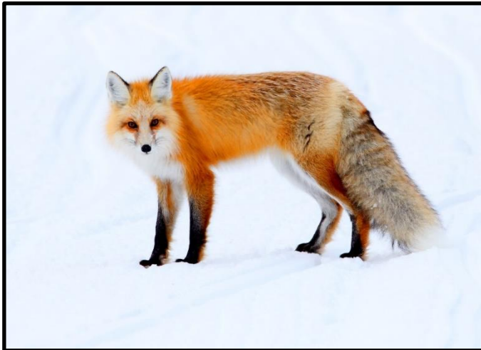
Figure 34 Red Fox