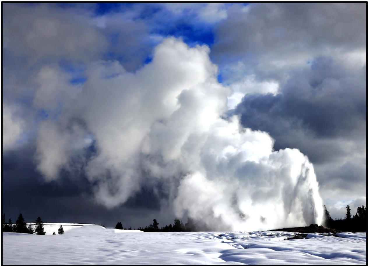
Figure 1 The dark clouds, late afternoon sunshine and shadows on the foreground snow make this a dramatic Old Faithful image.

Gerlach Nature Photography is an Authorized Permittee of the National Park Service