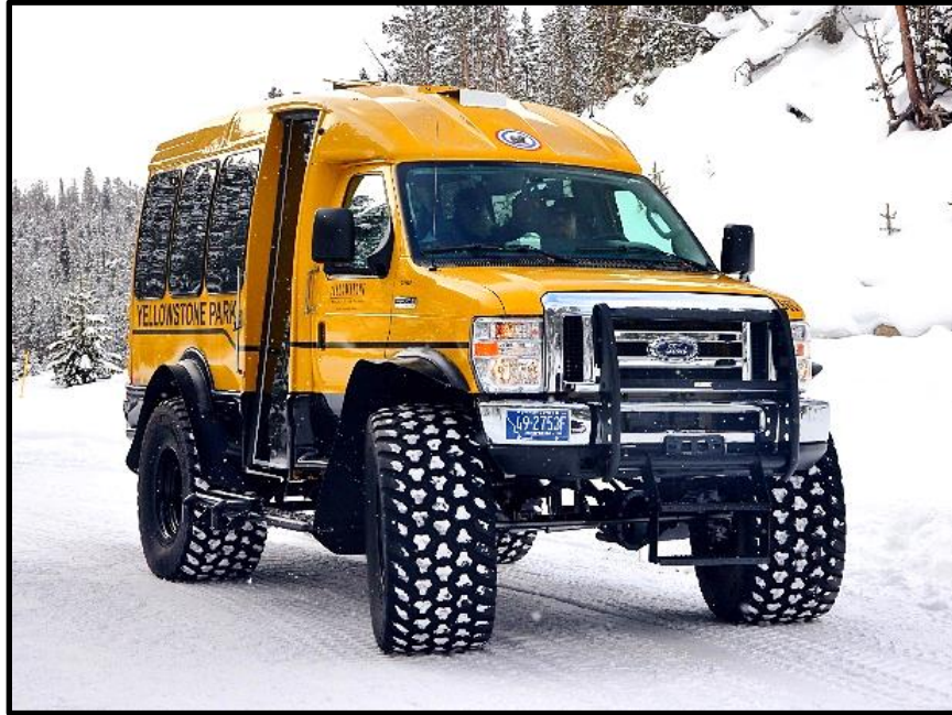
Figure 5 Our private snowcoach.