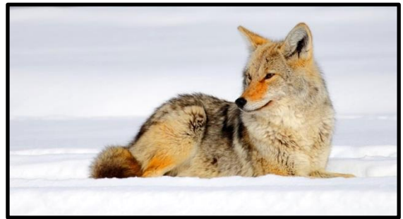
Figure 18 A restful coyote!