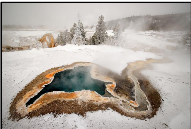
Figure 28 Blue Star Geyser