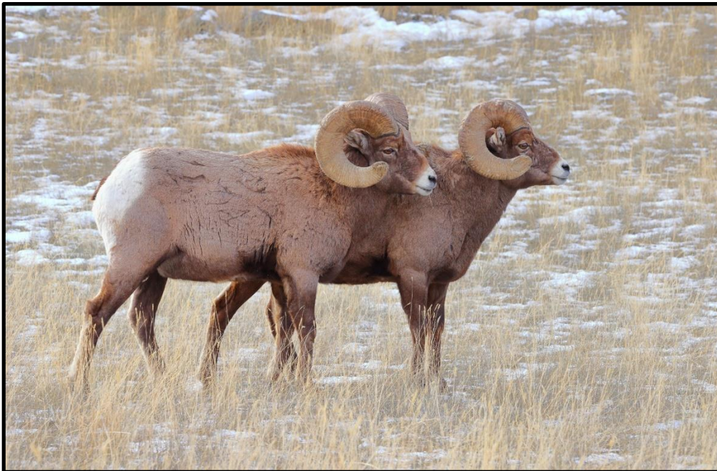
Figure 6 Large bighorn sheep rams are easy to photograph.