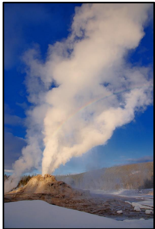
Figure 27 Castle geyser