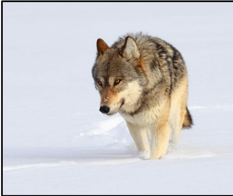
Figure 7 Sometimes you get lucky. This is a Yellowstone wolf approaching our snowcoach to within 35 yards! You cannot expect such a close encounter, but it is always possible!

We will prepare breakfast at our rental home in the morning. Then we leave in our Ford Expedition to photograph the abundant wildlife along the northern range or board the snow coach for travel to the park's interior. We board the snowcoaches by 8:00 am and stay out all day and return to Gardiner late in the day around 5:00pm.