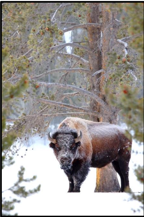
Figure 20 Bison on a COLD morning!