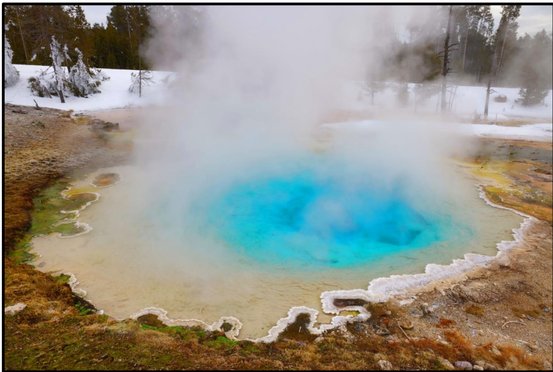
Figure 10 Silex spring is always fun to photograph. The breeze blowing the steam away reveals the colorful foreground.