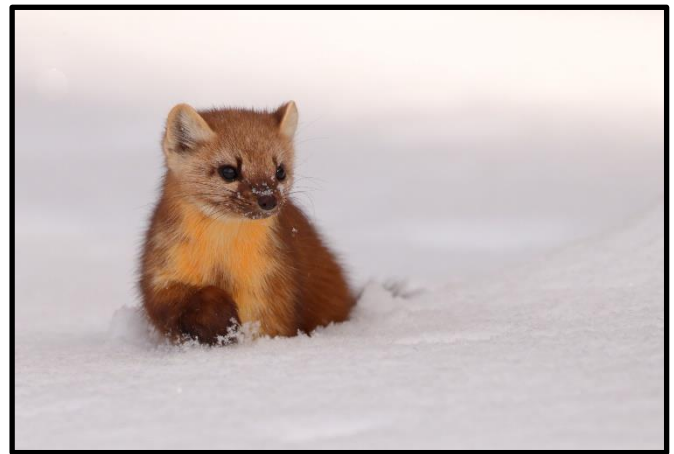
Figure 26 Pine marten