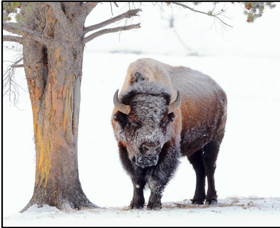
Figure 13 Cold clear nights produce frosty bison by the following morning.