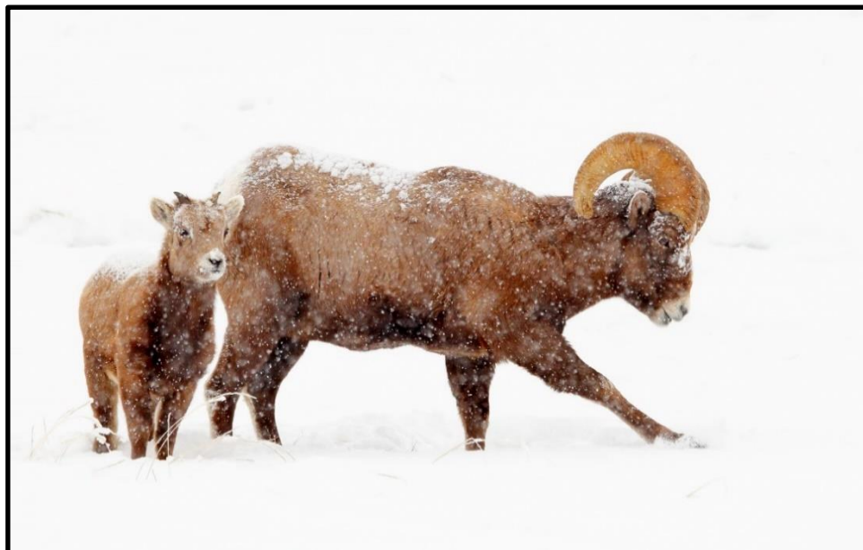
Figure 32 Bighorn Sheep