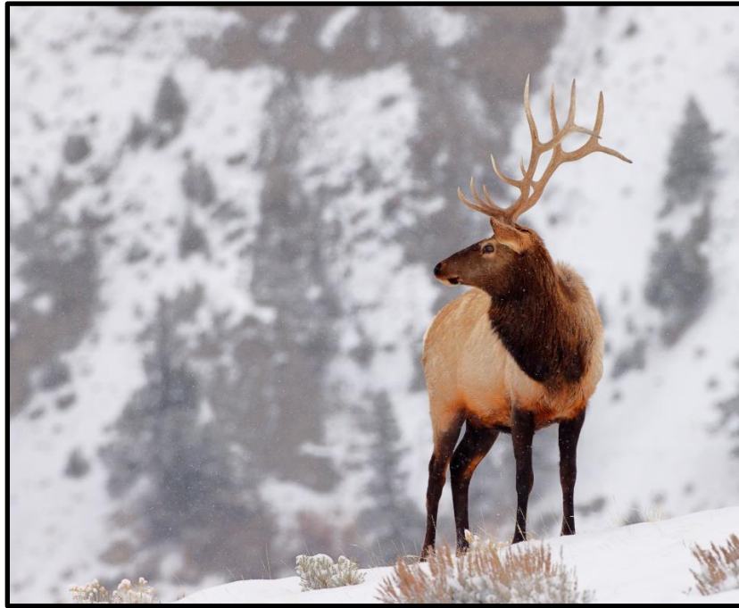
Figure 3 We are likely to photograph large bull elk!

In the geyser basins, snow and hoar frost cling to every tree that photographs beautifully against cobalt blue skies. Scenes we will photograph include: