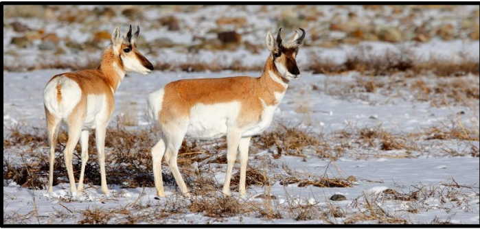
Figure 16 Pronghorn antelope