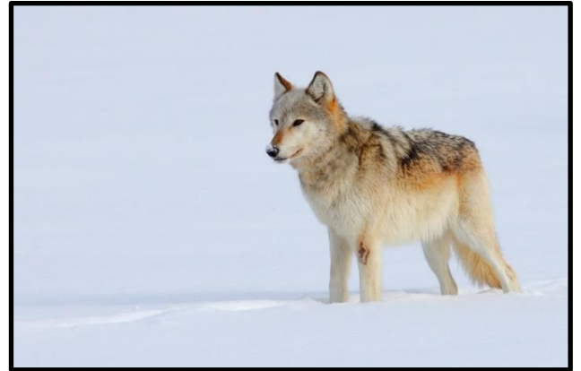
Figure 31 Wolf