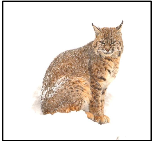
Figure 29 Bobcat