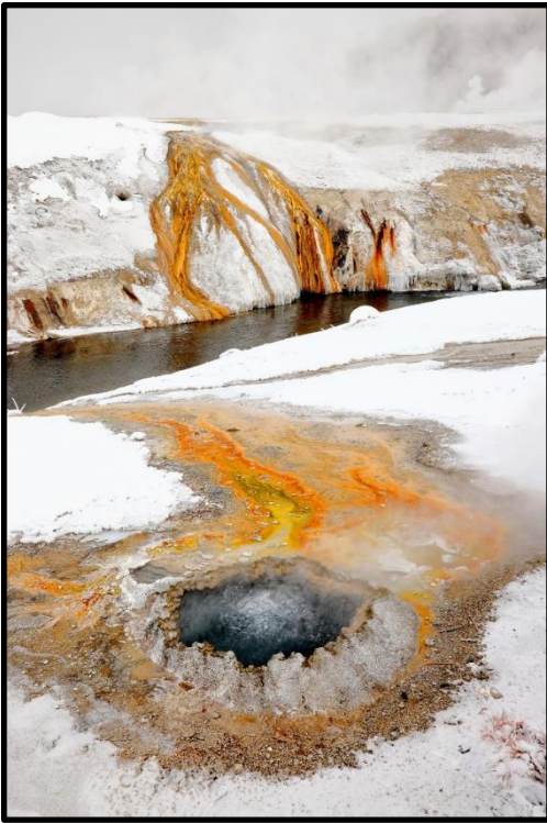
Figure 25 Chinese spring