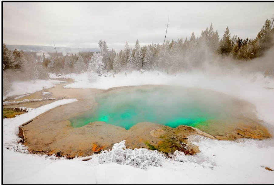
Figure 14 Even on a cloudy day, the springs in the thermal areas like Norris geyser basin make colorful photos. All of the wildlife photos below were shot in 2023 over a three-week period with a Canon R5 and the 100-500mm lens.