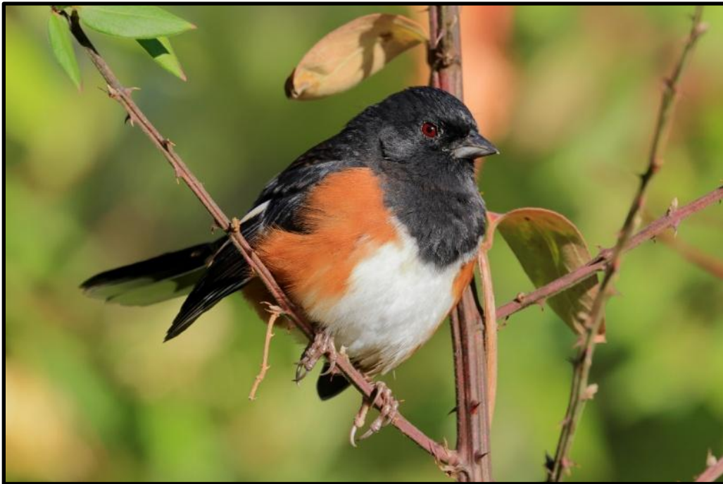
Figure 20 The Eastern towhee is a large member of the sparrow family and visits our feeding station.