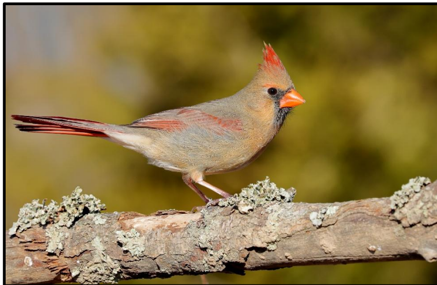
Figure 4 This is the female northern cardinal. We like her variety of colors. Notice how we carefully made the setup to provide a pleasing background. All the birds you photograph will have a non-distracting background like this one.

Thinking again of blue jays and cardinals, both are wonderful colorful birds and now I have plenty of them to photograph on our own Indiana property. Once we erected and stocked the bird feeders, northern cardinals became regular visitors.