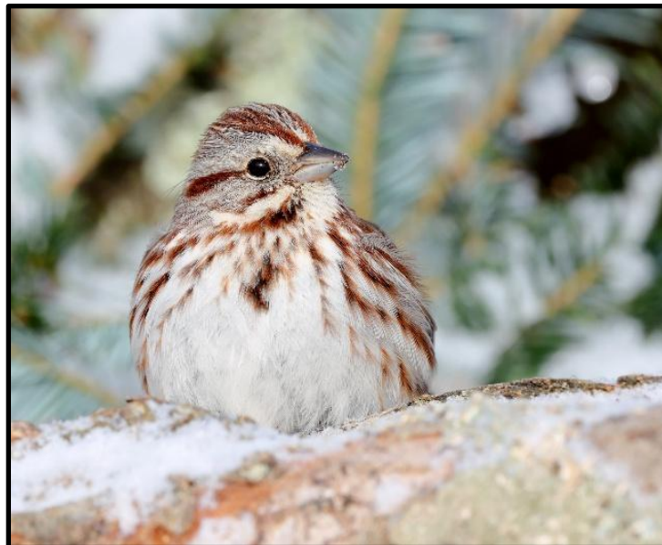
Figure 18 Song sparrows are permanent residents on our property.

Dixie Calderone at 812-350-0799 or email johnngerlachphotography@gmail.com