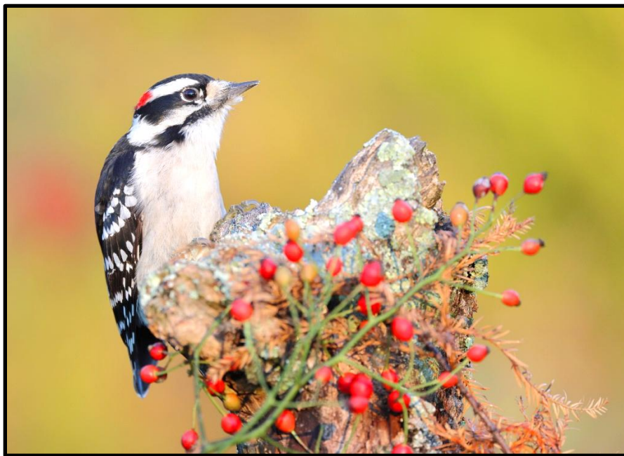
Figure 15 Downy woodpeckers are frequent at the photo stations.

Small birds are active! Even when perched, they continually change their head and body angles. For example, the Carolina wren is moving most of the time. The best way to capture excellent poses of this adorable but active bird is to follow it as it jumps or scampers along branches while continually shooting photos. Every once in a while, it does hold completely still and then you capture nice poses that are sharp! That means most of your wren images will not be what you want, but a few will be perfect. The wren is so quick that if you wait to see a great pose, and then press the shutter button, nearly always you are too late to capture the pose you saw. Therefore, shoot continuously. John will show you how he reviews six images at once in a couple of seconds, and if no suitable poses are present, he moves on to the next six images. You can cull a lot of photos this way once you know how. John easily sorts through 3000 images per hour to reduce them down to less than 3%.