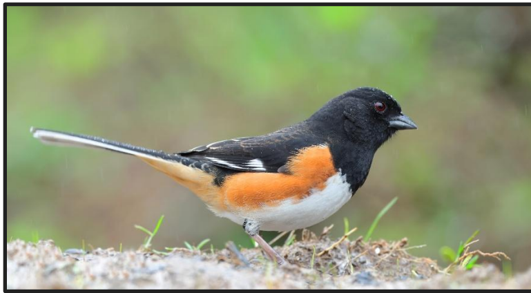
Figure 2 The Eastern towhee is a permanent resident of our Indiana property. This is one of the "leaf kickers" who prefer to feed on the ground and not fly up to our food sets. By building the blind in a low spot of our backyard, you are eye level to the ground when seated in the blind.

Winters are long, cold, and snowy at our Idaho mountain home. Imagine having snow on the ground to shovel from early November through early May. The heavy snowfall makes living in the Idaho mountains challenging six months of the year. The severe winters drive nearly all wildlife away. Except for chickadees, everything else flies south or to lower elevation offering us few wintering birds to photograph. We had been looking for a second home where some snowy days occur, but not too many and wintering birds are abundant. Shoveling the driveway and the roof of the house has lost its appeal to us. The less shoveling, the better!