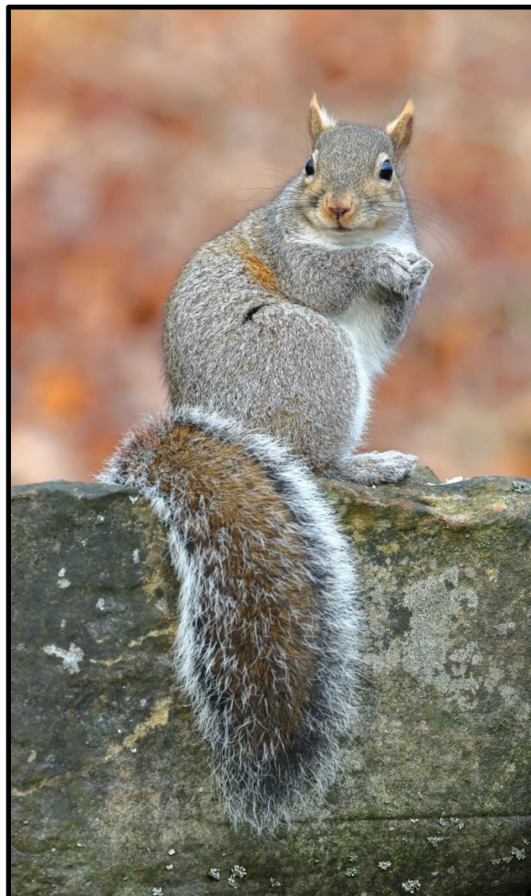
Figure 25 Gray squirrels are abundant on our property. You will easily photograph them.