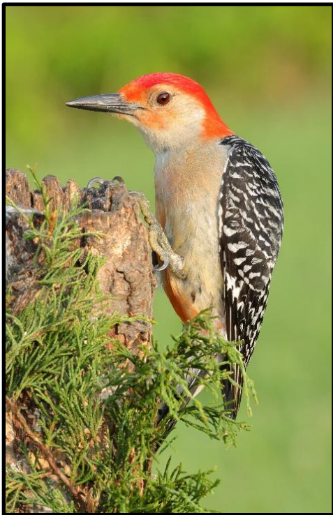
Figure 8 Red-bellied woodpecker

Both of the woodpecker shown below love the suet we provide.