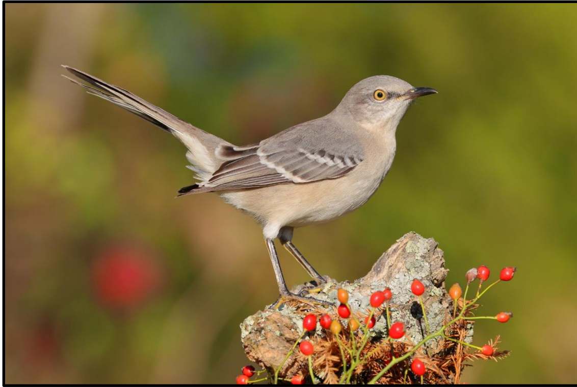
Figure 12 Northern mockingbirds readily come for the bark butter we put out for them. Notice we like natural log perches with character, and we added some red berries for a splash of color.