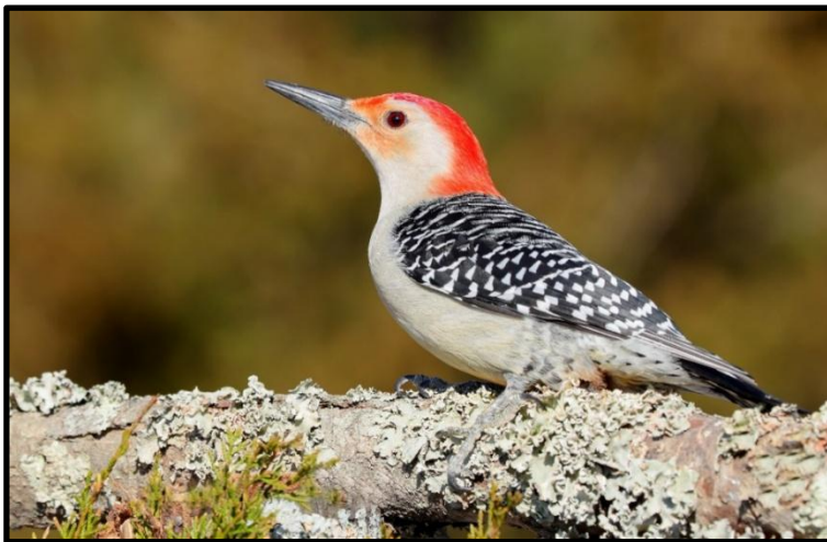
Figure 1 Red-bellied woodpeckers are frequent visitors to the feeding station. You will photo these beautiful birds a lot.

Mon and Tuesday – Intensive morning and afternoon bird photography and a morning session on Wednesday if your travel permits.