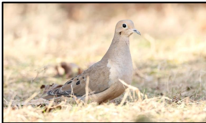
Figure 16 Mourning doves prefer corn, so we always put out some corn for them and the gray squirrels.

Dixie Calderone 3750 S. Whitehorse Rd Nashville IN 47448