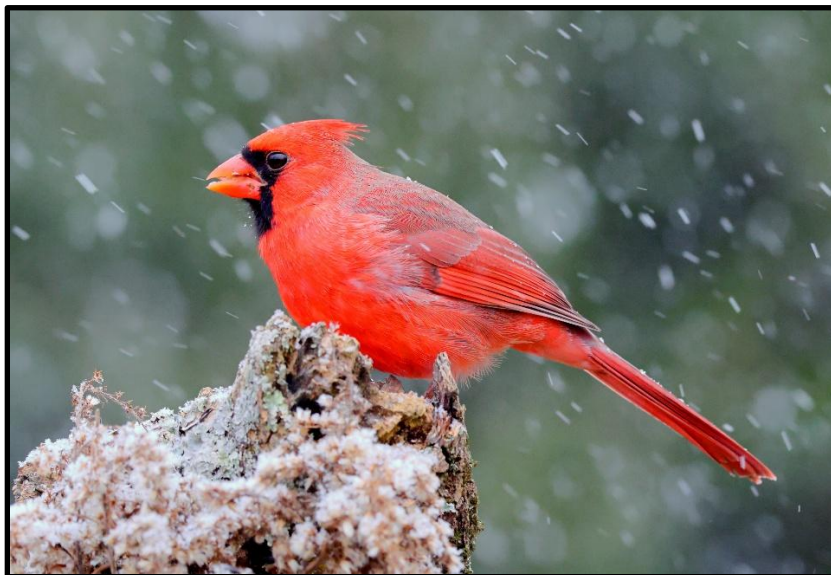
Figure 11 A bright red northern cardinal is striking anytime, but especially when the snow is falling.

John and Dixie, passionate photography instructors, eagerly share their expertise with participants. Our workshop focuses on essential bird photography techniques that anyone can learn to capture stunning images. With an intensive program and a small group of just two people, you will receive plenty of personalized instruction and enjoy abundant photo opportunities—making it easy to significantly improve your skills.