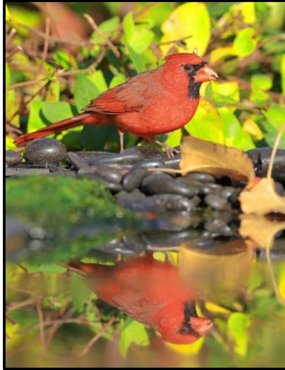
Figure 10 By putting sunflower hearts among the black stones at the rear of the pool, this northern cardinal came to eat them while providing a nice reflection in the pool.