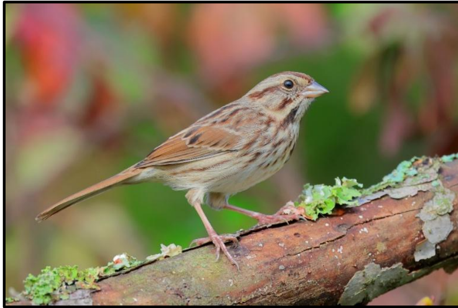
Figure 17 The song sparrow is the most abundant sparrow on our Indiana property.

The $1350 workshop fee is not refundable. Please buy trip cancellation insurance to protect your investment.