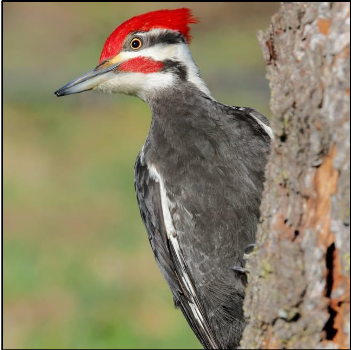
Figure 21 The male pileated woodpecker is a regular in our yard. He can really tear apart wood. Thankfully, our home is made out of stone.