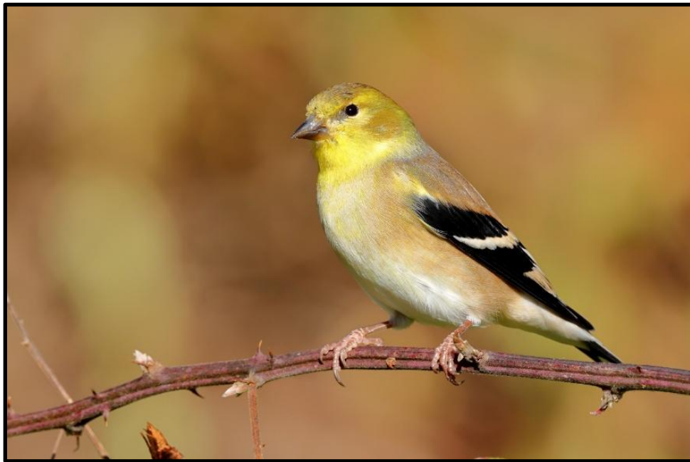
Figure 6 This American goldfinch is already beginning to get its yellow feathers in late February. They are abundant on our property.

Both morning and afternoon are productive times at the feeding station. We have more than a dozen different props to use. We discovered this winter that a mixture of suet and peanut butter (aka bark butter) is a delicious meal for nearly all birds. For example, our local Carolina wrens do not eat birdseed, but crave bark butter, and that provides plenty of opportunities to photograph them. And for the majority of birds that like birdseed, we have found nothing better than sunflower hearts which are black-oil sunflower seeds with the inedible black shells removed.