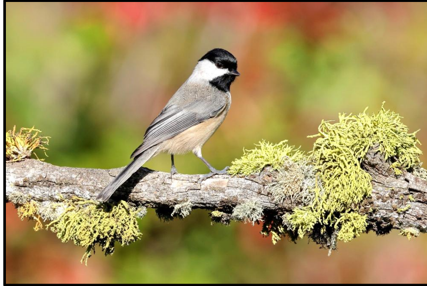
Figure 13 You will get many chances to photograph Carolina chickadees! They are abundant and frequently appear at the photo props.