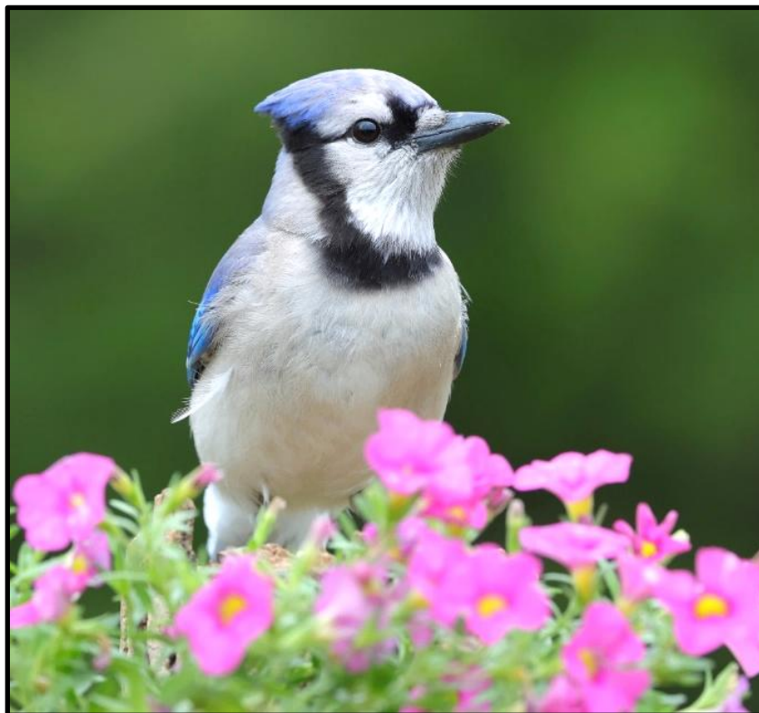
Figure 23 We added these pink flowers to add some color to the blue jay scene.