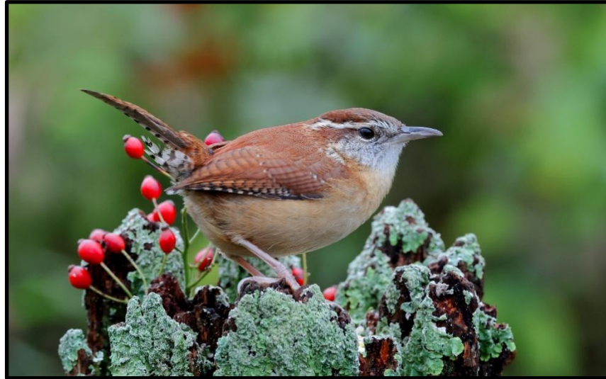
Figure 3 The Carolina wren is adorable and active! It regularly comes in for bark butter.

Thinking again of blue jays and cardinals, both are wonderful colorful birds and now I have plenty of them to photograph on our own Indiana property. Once we erected and stocked the bird feeders, northern cardinals became regular visitors.