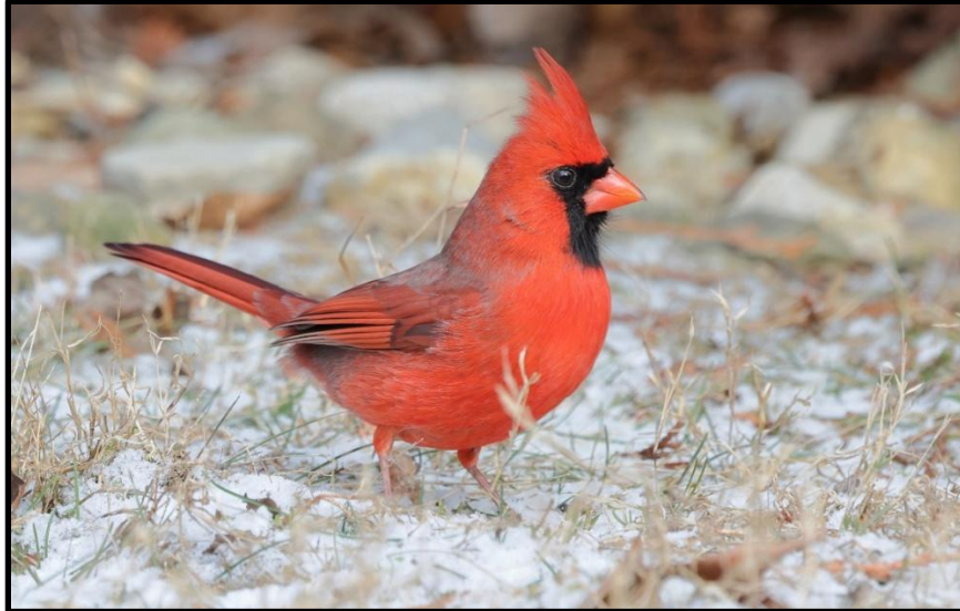
Figure 24 Notice the low photo angle to this male northern cardinal from the blind you will be using.