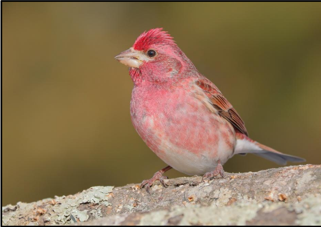
Figure 7 During March, there is a good chance of photographing this purple finch – a nomad from the north.

The main focus of this workshop is bird photography at our feeder stations. Of course, for better bird photos, we disguise the feeders. All birds are using natural perches we provide. No bird feeders or bird seed will appear in the photos. We have a well-built wooden photo hide that is ideal for two photographers at once. It is comfortable to use with a solid wooden floor, sides and waterproof roof. The birds are accustomed to it, so they readily