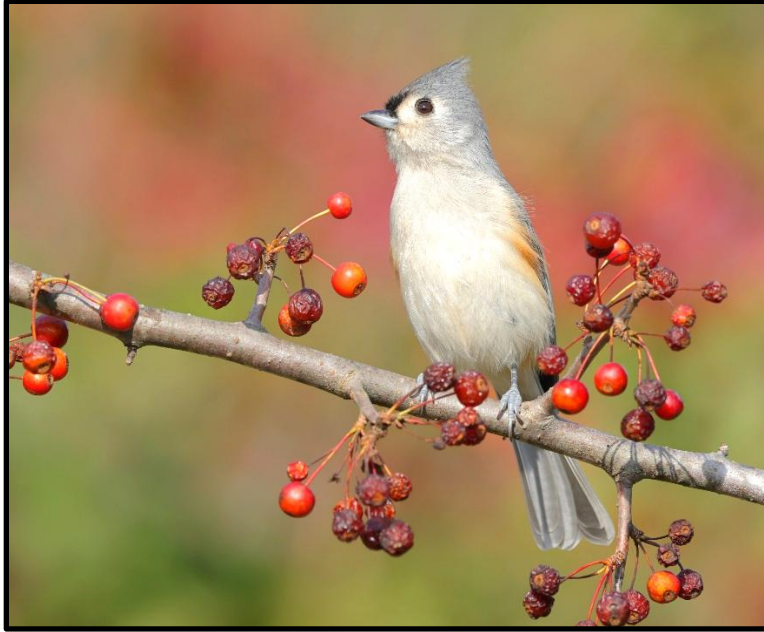
Figure 14 The tufted titmouse is another active bird like the chickadee and Carolina wren that you get plenty of chances to photograph.