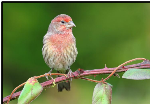
Figure 5 The house finch is a common visitor to our backyard feeding station.