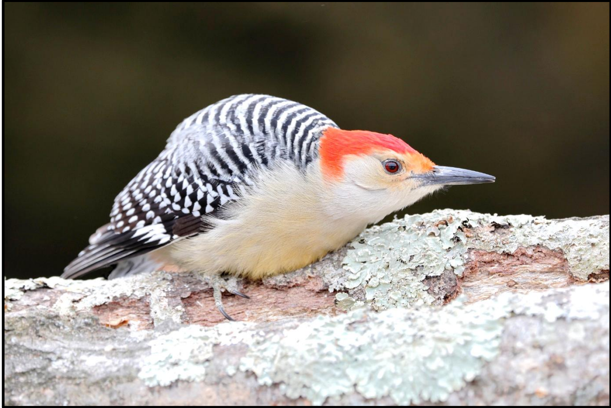
Figure 19 The red-bellied woodpecker is one of the easiest birds to photograph on our Indiana property as they visit the feeding station frequently.