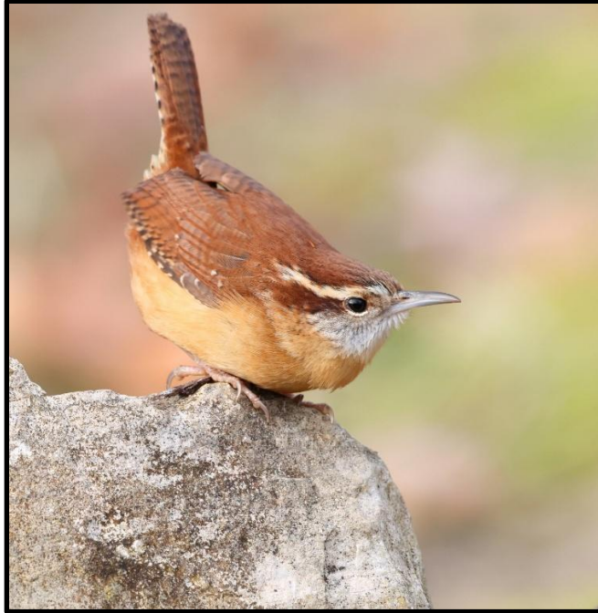
Figure 22 Carolina wrens are both adorable and comical! They love bark butter.