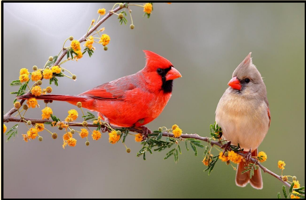
Figure 1 A Northern cardinal pair having family time together.

The south Texas Laguna Seca Ranch is known worldwide for superb bird photography. The 700 acre ranch is undeveloped pristine brushland that attracts an abundance of colorful unique birds. The ranch owner built four permanent photography hides designed by photographers near tiny ponds right in front of the