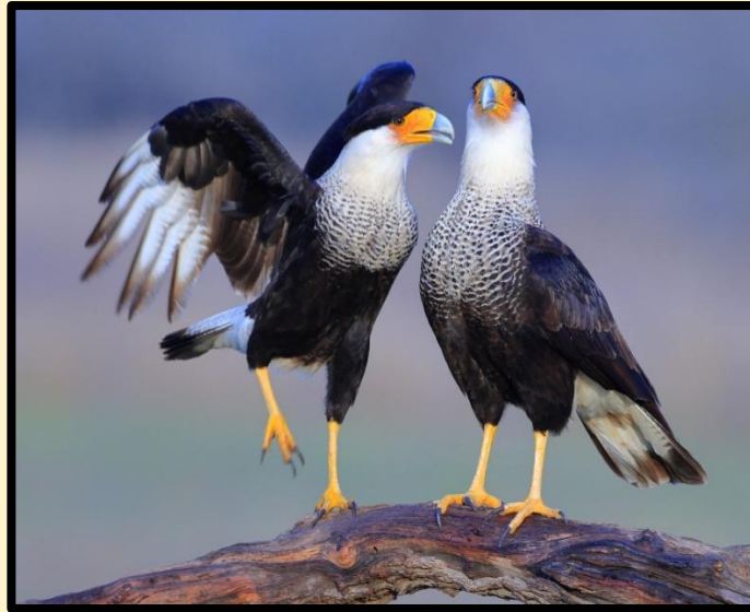
Figure 2 Crested caracaras have a discussion.