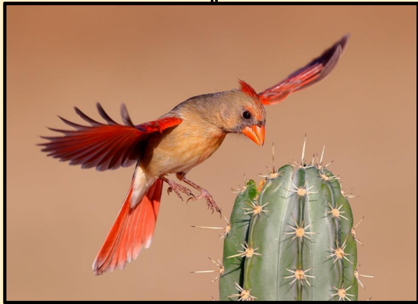
Figure 3 Northern cardinals are common in south Texas and readily attracted to the water and food provided at the ranch.