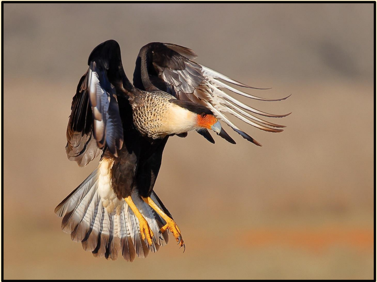
Figure 13 Crested caracara preparing to land.