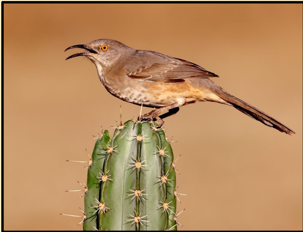
Figure 4 The curved-billed thrasher is a common resident that loves to pose for the camera!