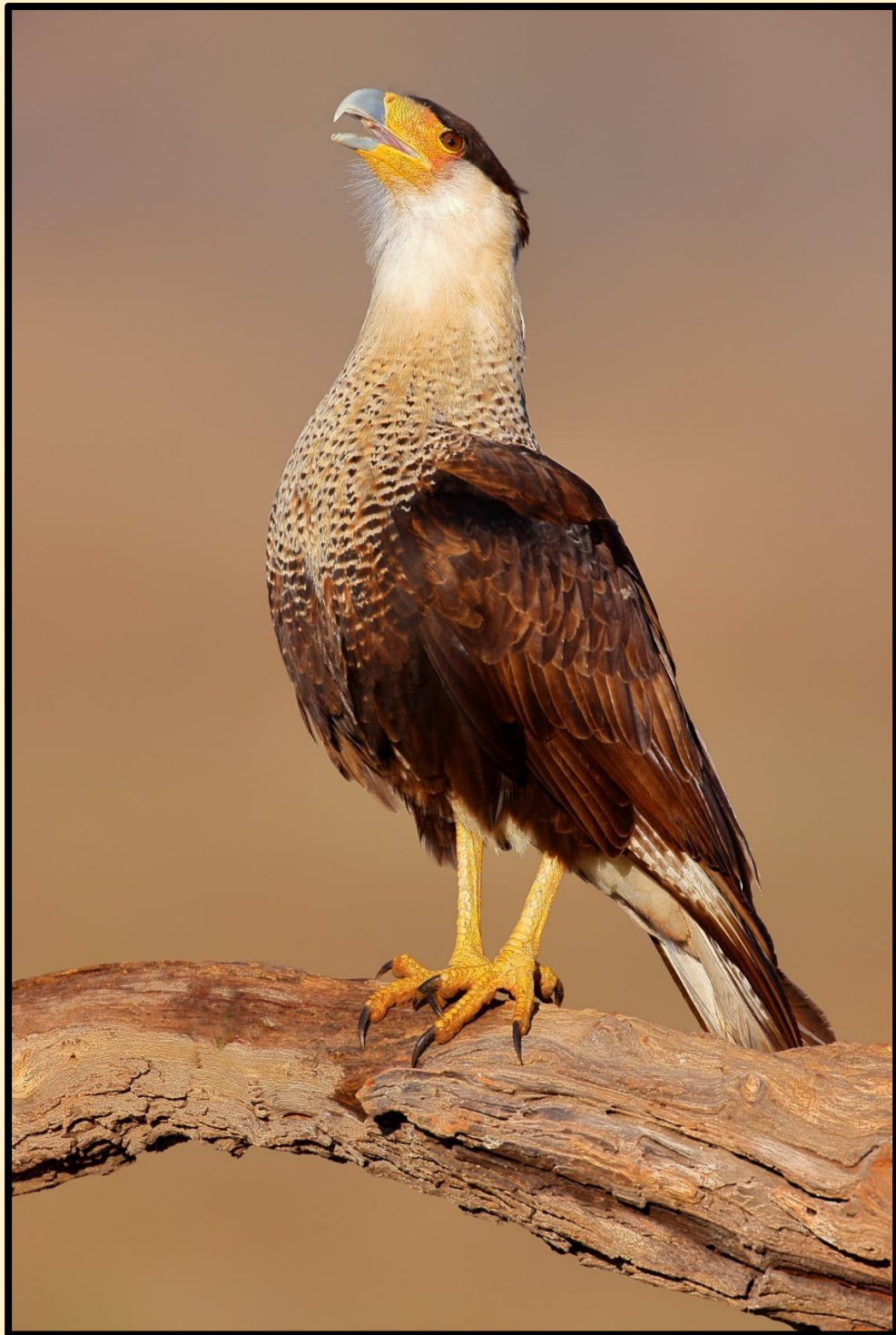
Figure 7 Crested caracaras are animated raptors that are a delight to photograph.