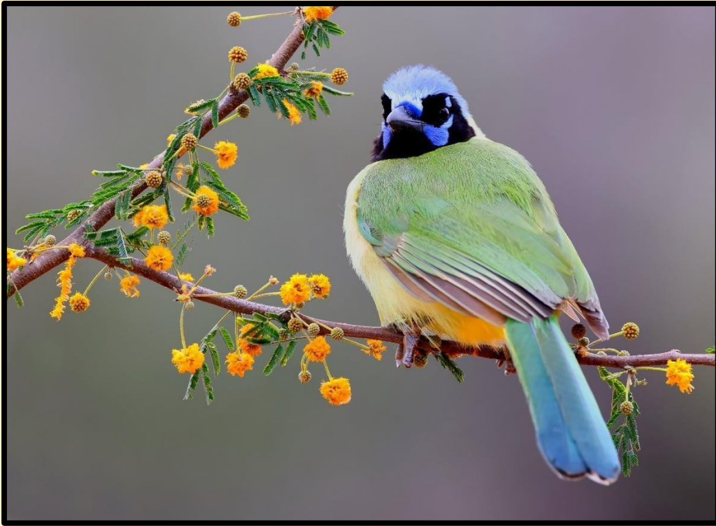
Figure 8 You probably know the blue jay. Did you know another jay called the green jay is common at the Laguna Seca Ranch? They mostly live in Mexico but are abundant along the Texas border.