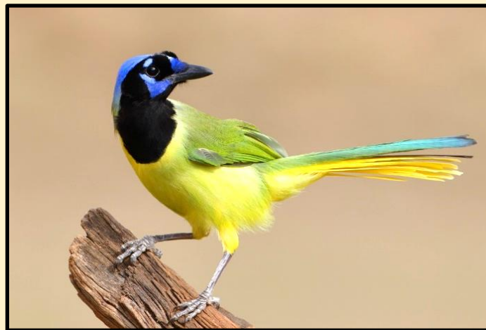
Figure 1 You will get plenty of chances to photograph the green jay!

These tours are spectacular for bird photography and April is the optimal time to visit the ranch. Two dozen or more crested caracaras are drawn to the photo blinds with meat. And many resident birds such as green jays, cardinals, black-crested titmice, long-billed thrashers, and pyrrhuloxias regularly visit the small bird photo blinds. During April, spring migration is underway, and this is a superb time to photograph migrating birds along with all the local birds living at the ranch. The abundance of colorful songbirds, such as painted buntings and summer tanagers, at the photo blinds is a joy to see and photograph. Many of the birds like this striking green jay you probably have never seen before, but you will make plenty of photos of them in this workshop.