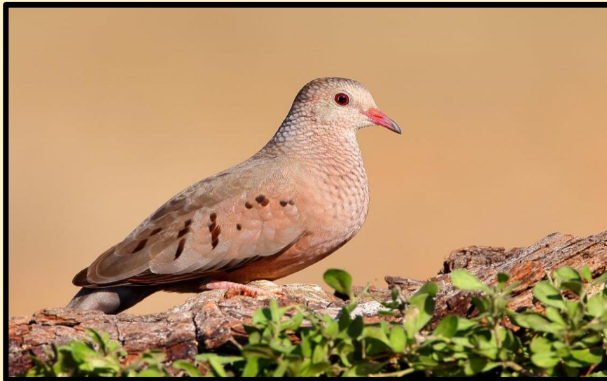
Figure 2 The striking ground dove is a joy to see and photograph!