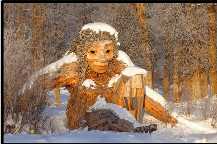
Figure 20 Even this woodland "wild women" is found near Jackson. You will see and photograph it!