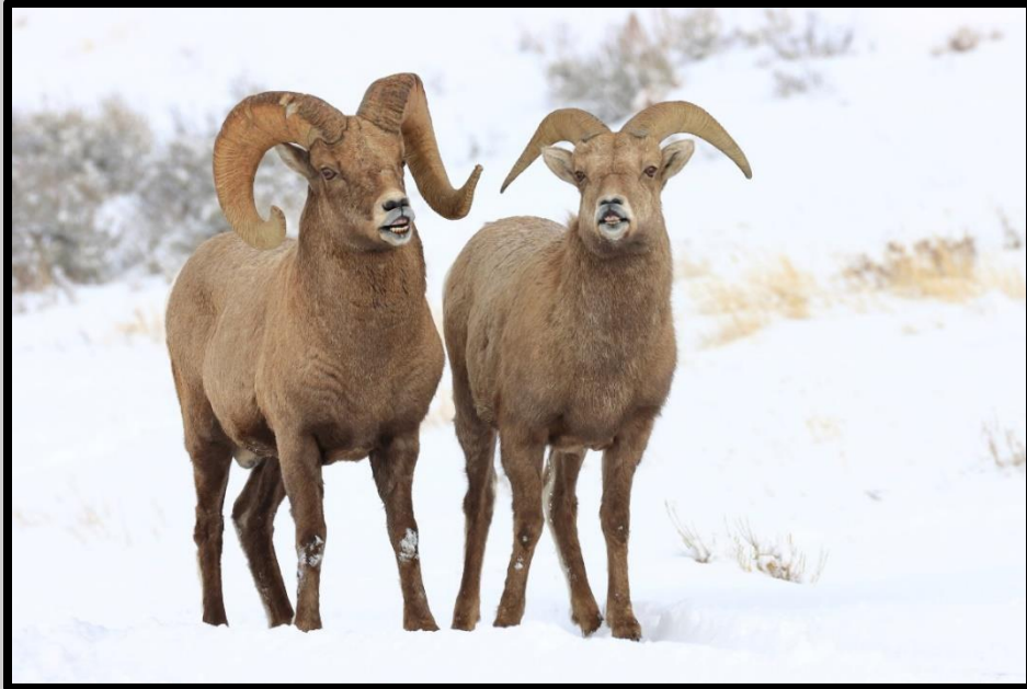
Figure 4 Bighorn sheep are plentiful at Miller Butte in the National Elk Refuge. Each afternoon they descend the butte to feed on grass next to the access road. They are super easy to photograph well!

We can see the Tetons from our home, photograph in the park frequently, and thoroughly know the area. From having led hundreds of field workshops on photography, we are skilled at guiding photography groups to optimum locations to perfect their photo skills, shoot memorable images, and above all, to enjoy the grandeur of magnificent Grand Tetons National Park.