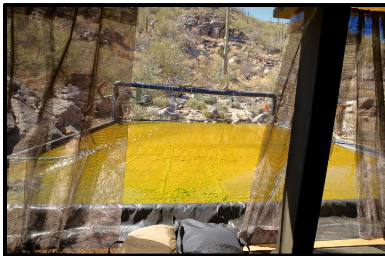
Figure 6 A view of the reflection pool from inside the blind..

Important Notice: The enormous number of images our workshop participants shoot creates their biggest problem. It is rather easy to shoot 6,000 images per day and we had one client shoot over 10,000 images per day. Downloading and