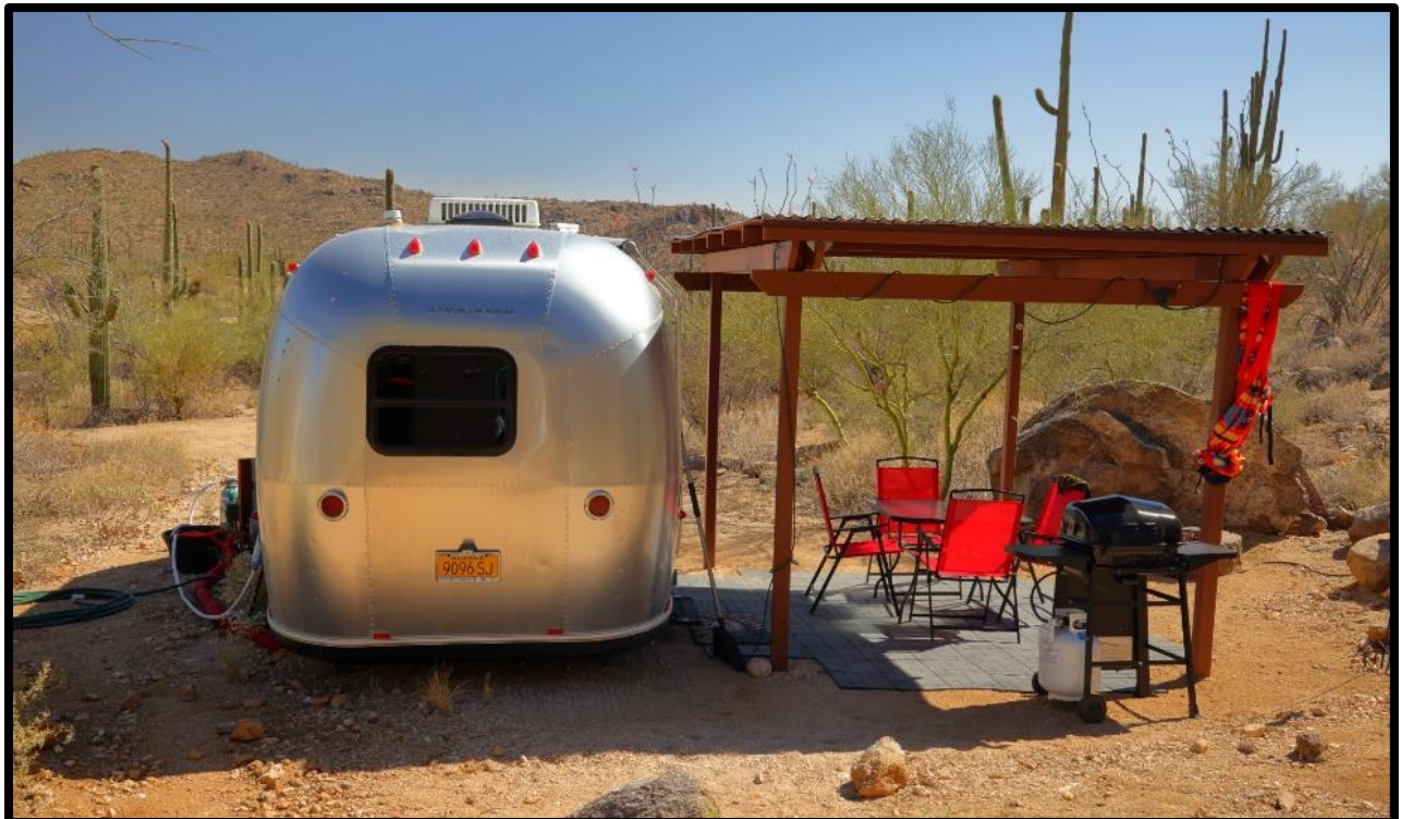
Figure 9 This will be our base camp at the Desert Retreat where we have electric power, water, restroom, and nice chairs to sit in. Notice how remote this camp is compared to Tucson.