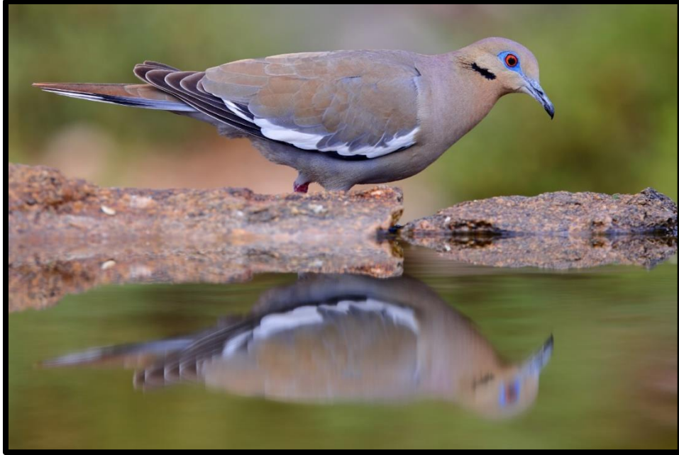
Figure 14 A white-winged dove makes a gorgeous image at the reflection pool where you will be each morning.