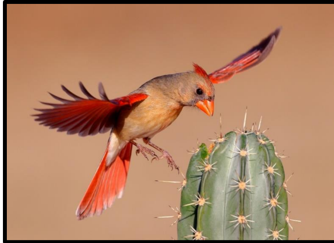
Figure 3 Northern cardinals are common here and readily attracted to the food provided at the Desert Retreat.