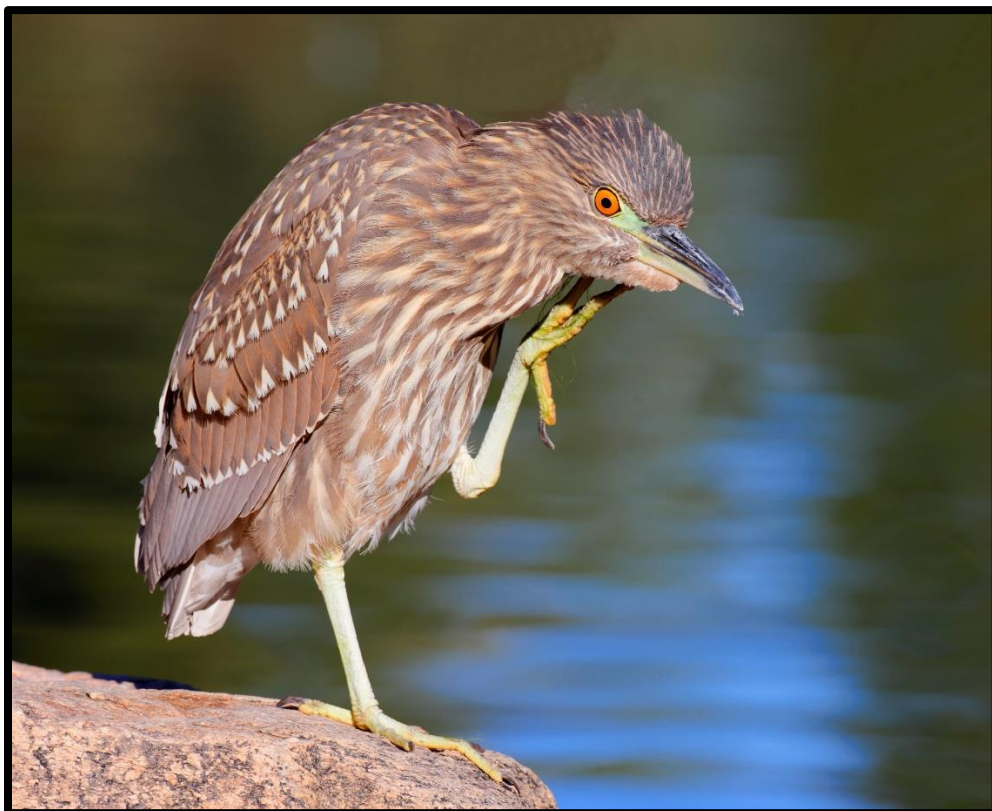
Figure 17 A young, black-crowned night heron on the duck pond in Tucson. Photographed from a distance of 10 feet.