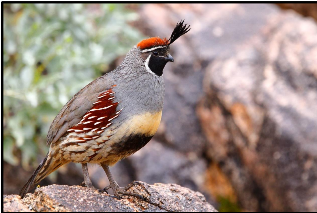
Figure 11 Gambel's quail are common at the retreat.