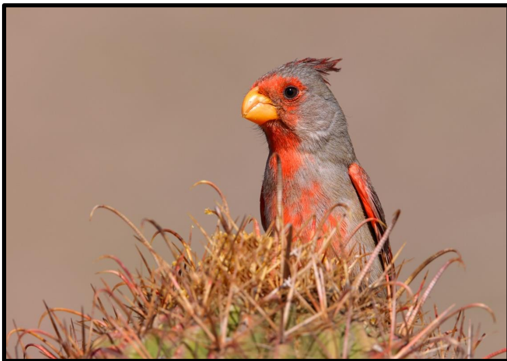
Figure 4 The gorgeous pyrrhuloxia is striking in its gray and red feathers.

We strongly suggest buying trip cancellation insurance to protect your investment.