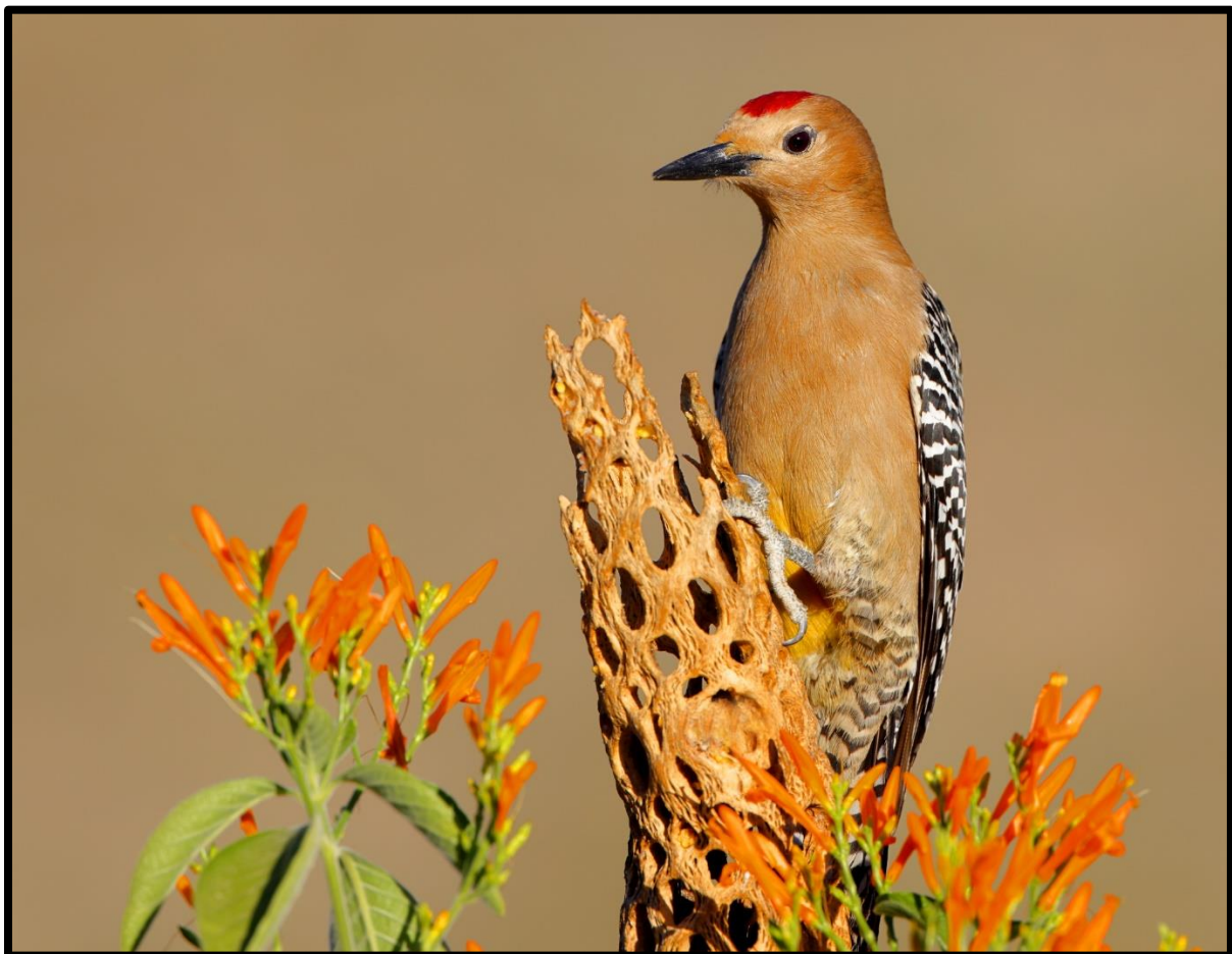
Figure 7 Gila woodpeckers are fun to photograph and frequent visitors at the Desert Retreat setups. They are incredibly abundant at the Desert Retreat. You could call them a “flock of woodpeckers.”