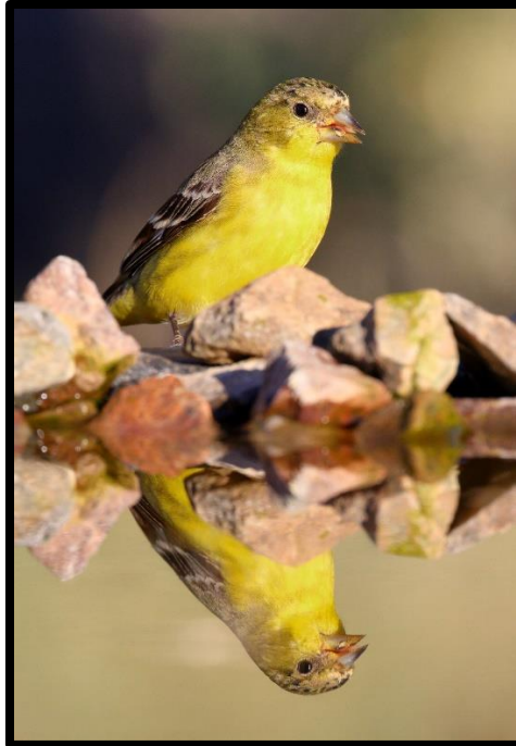
Figure 16 Lesser Goldfinch at the Reflection Pool