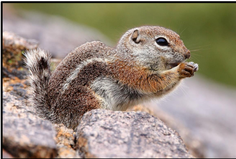
Figure 13 Harris Ground Squirrels frequently pose for you too!